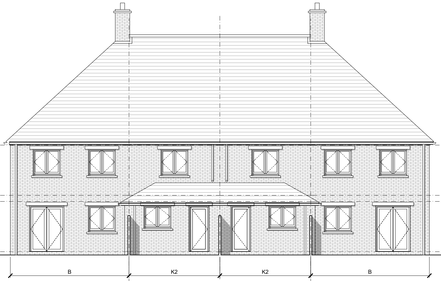
Rear Elevation - BK2K2B 1:100 (A3)