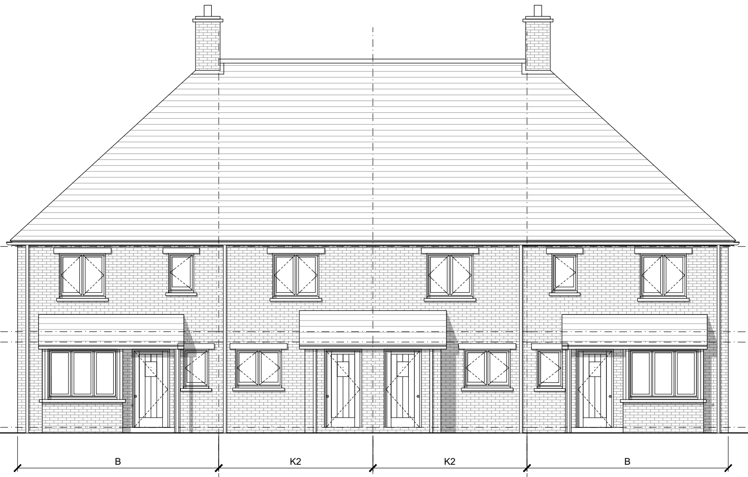
Front Elevation - BK2K2B 1:100 (A3)