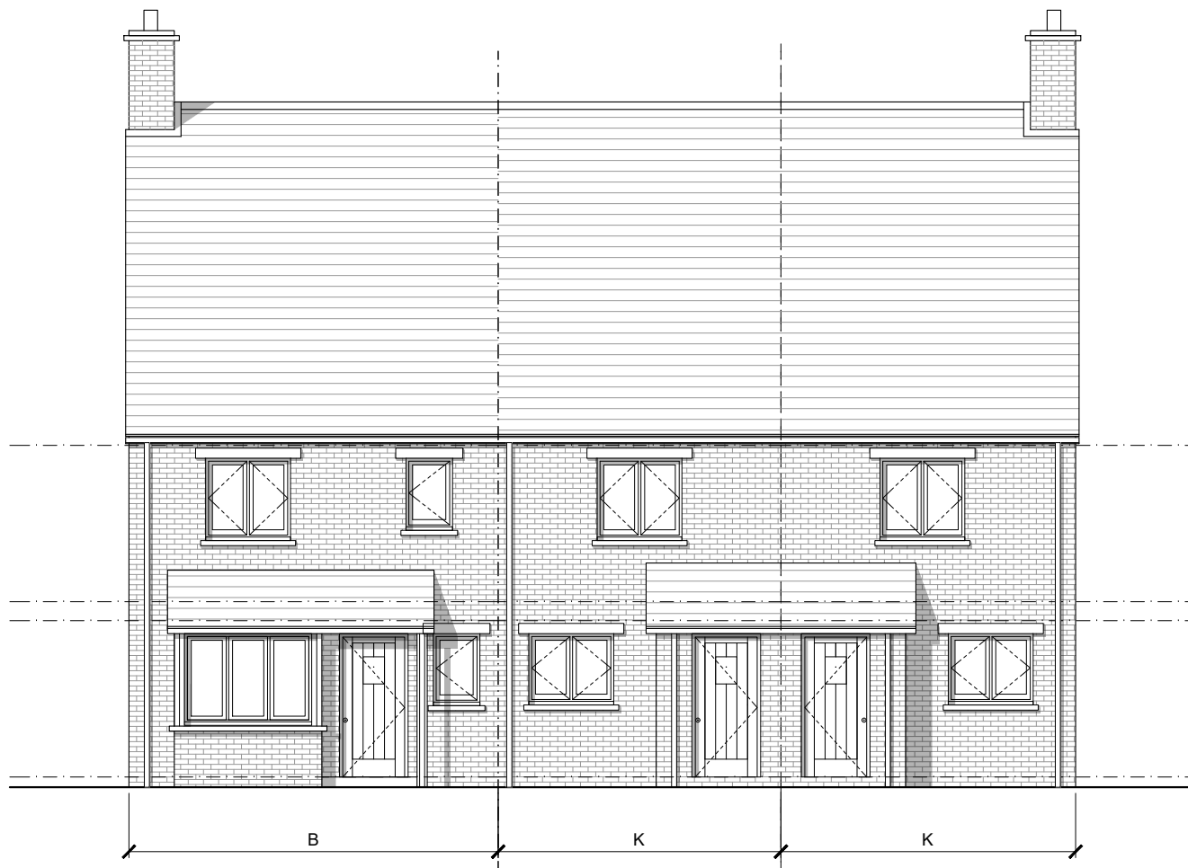
Front Elevation - BKK 1:100 (A3)