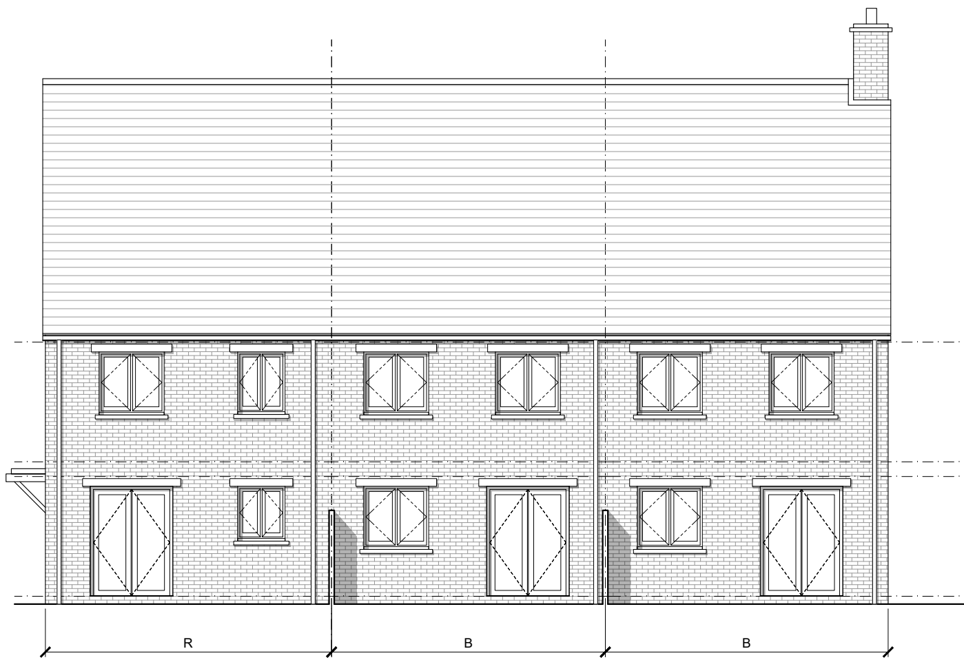
Rear Elevation - BBR 1:100 (A3)