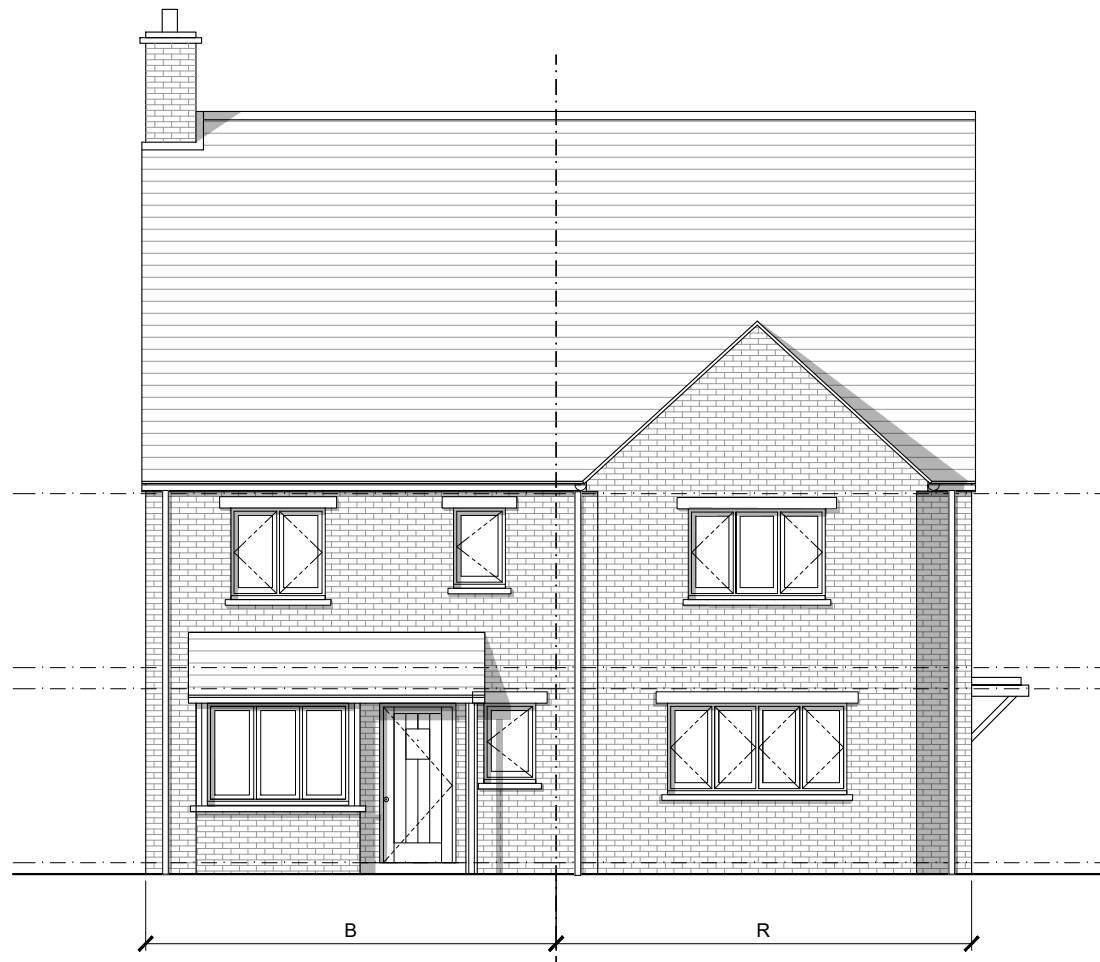
Front Elevation - BR 1:100 (A3)