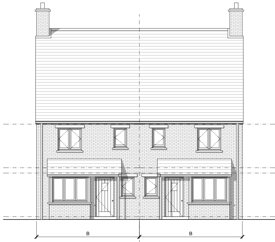
Front Elevation - BB 1:100 (A3)