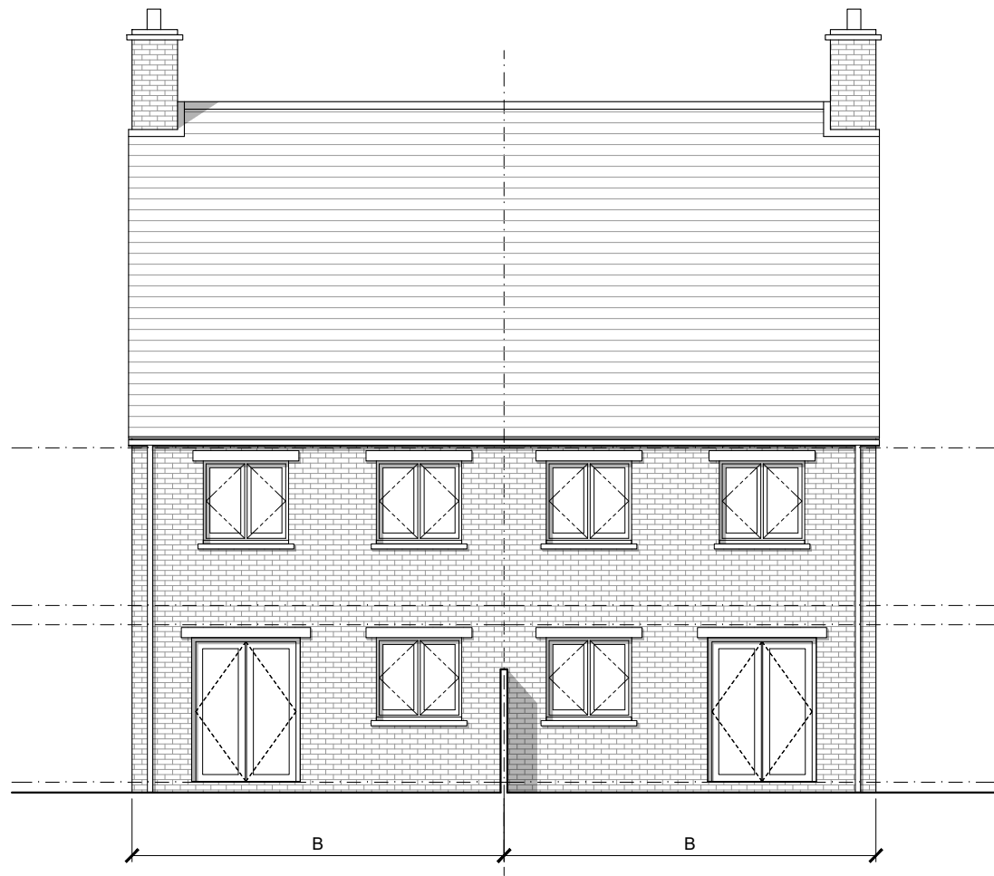
Rear Elevation - BB 1:100 (A3)