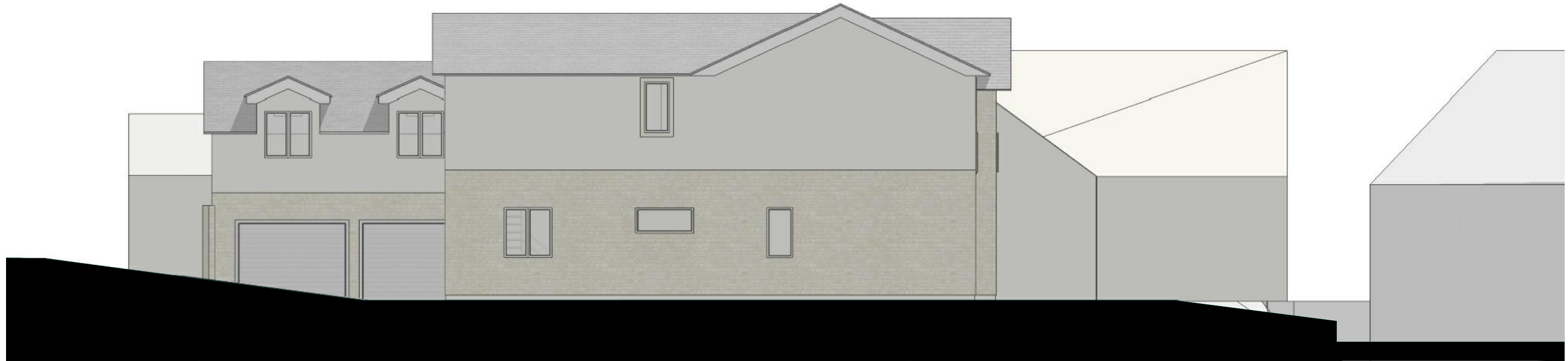
North Elevation A