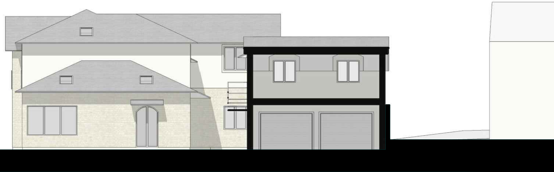
South Elevation A - Section through garage