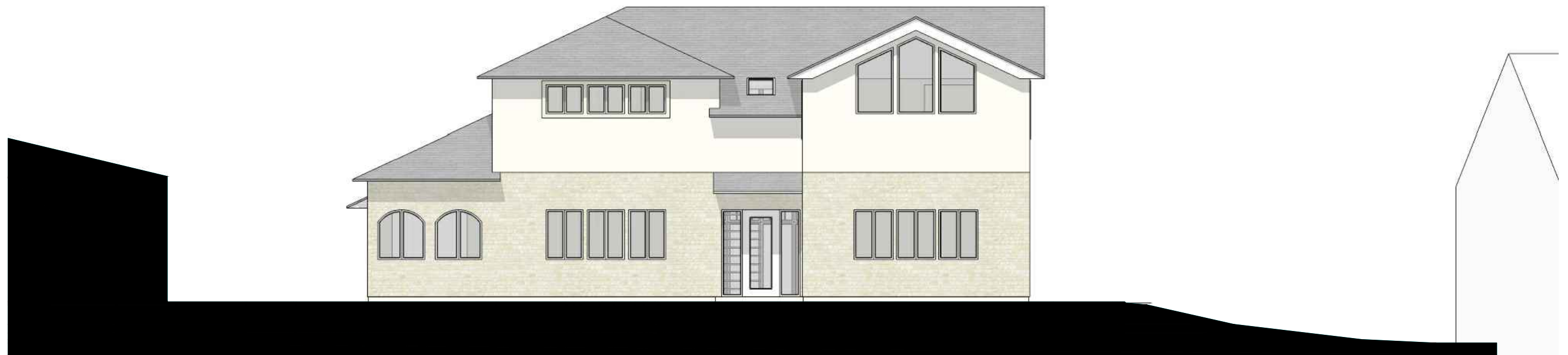
East Elevation B - House only