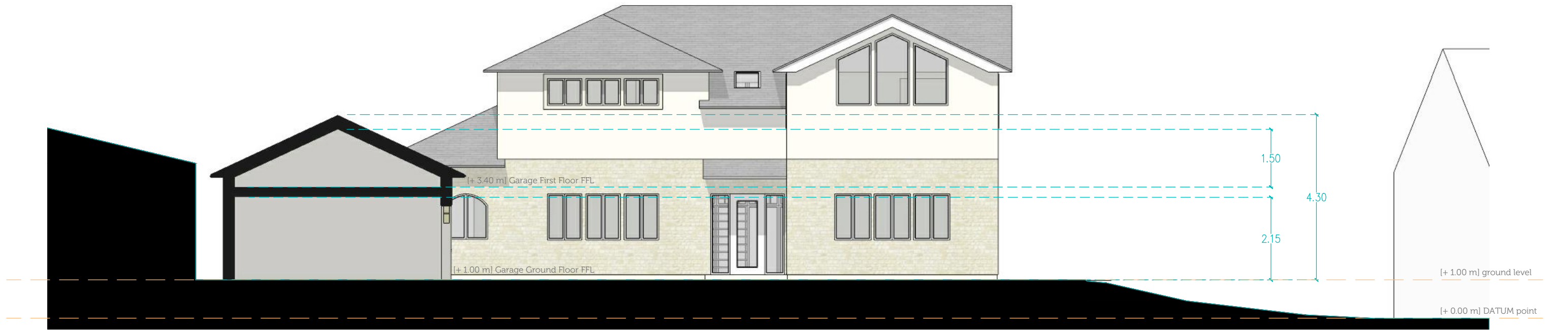
East Elevation A - Section through garage