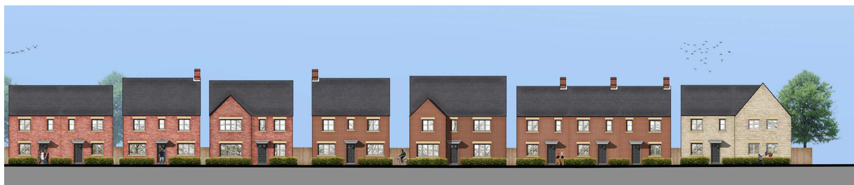
Street Scene B-B cont...