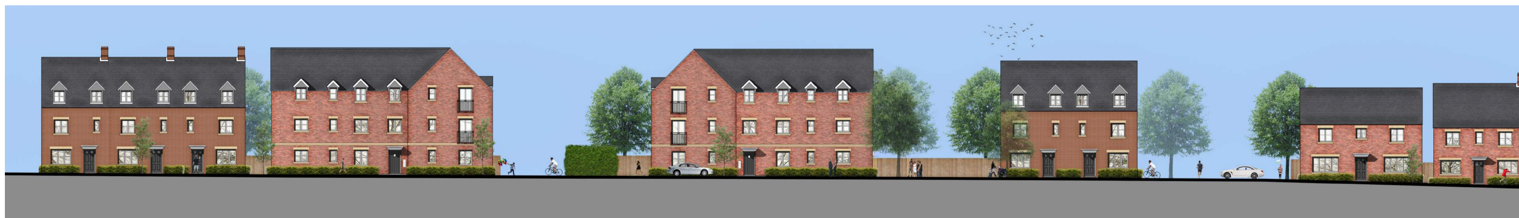
Street Scene B-B