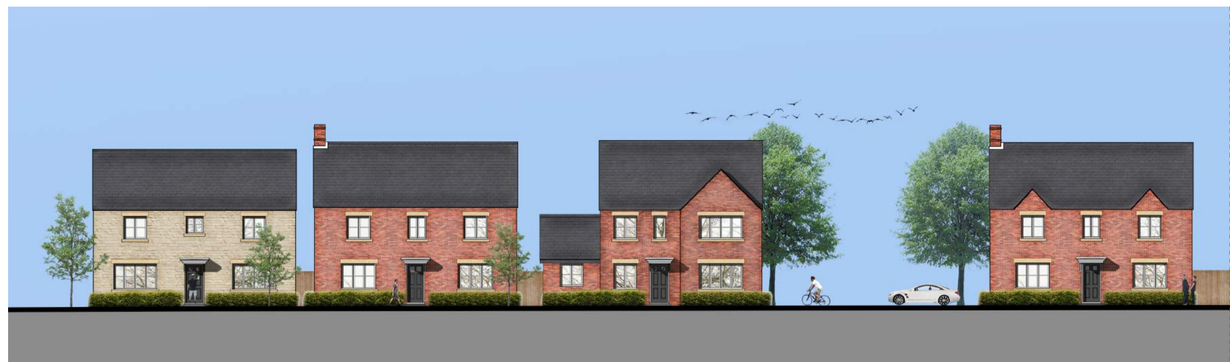
Street Scene A-A