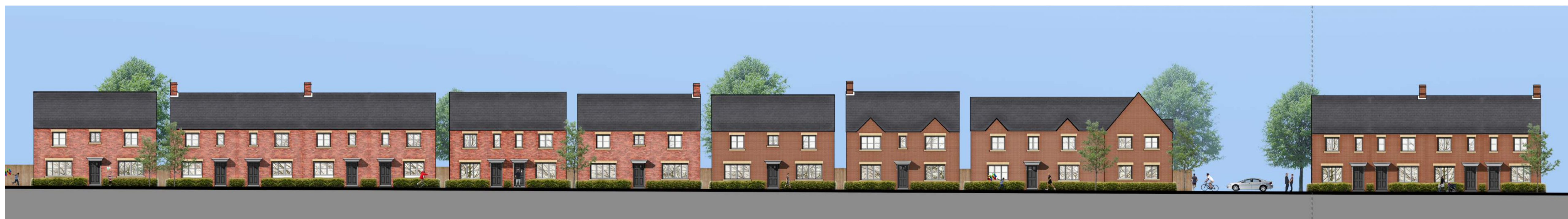
Street Scene A-A cont...