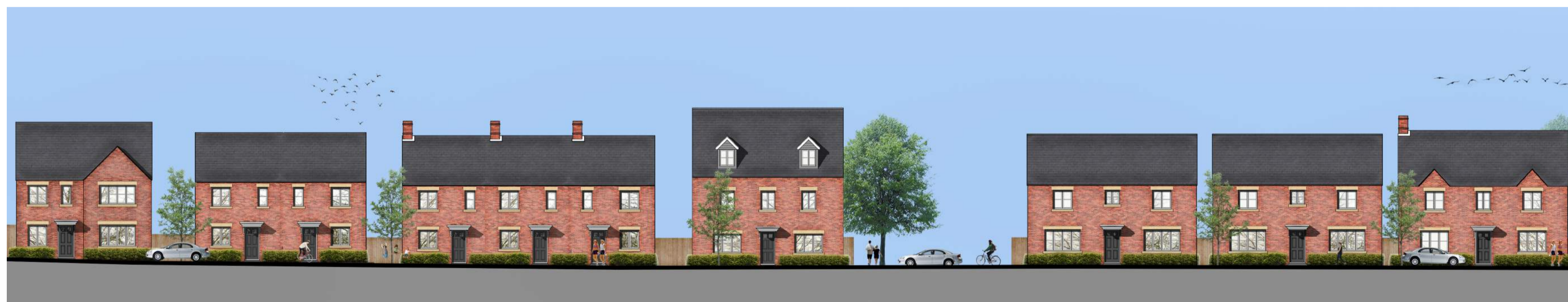
Street Scene B-B cont...