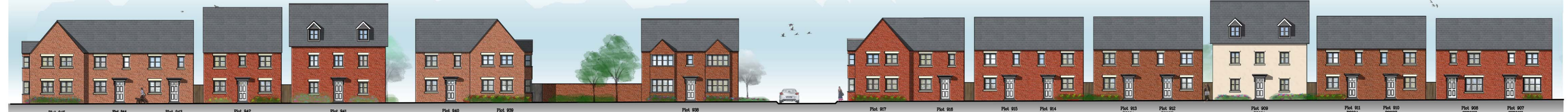
View 6 Plot 945 P30CA Plot 944 P30A Plot 943 P30CA Plot 942 P402A Plot 941 P30CA Plot 940 P30CA Plot 939 P30CE Plot 938 P30CA Plot 937 P30CA Plot 936 P30CA Plot 935 P30CA Plot 934 P30CE Plot 933 P30CA Plot 932 P30CE Plot 931 P30CA Plot 930 P30CA Plot 929 SP300E Plot 928 P30CE Plot 927 SP300E