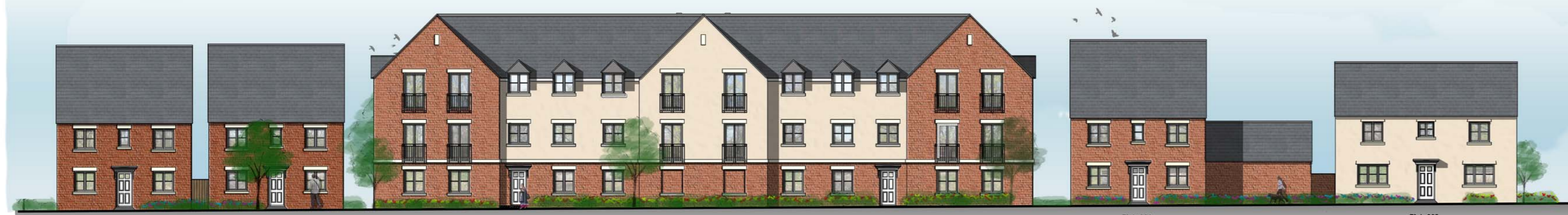
View 4 Plot 978 P402A Plot 977 P402E Plot 965-976 SP215 Plot 964 SP402A Plot 963 P4008E