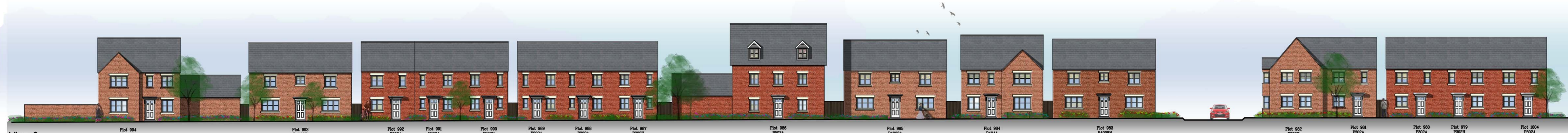
View 3 Plot 994 P404E Plot 993 P4008E Plot 992 P30CA Plot 991 P30CA Plot 990 P30CE Plot 989 P30CA Plot 988 P30CA Plot 987 P30CE Plot 986 P30CA Plot 985 P4008A Plot 984 P404E Plot 983 P4008E Plot 982 P30CE Plot 981 P30CA Plot 980 P30CA Plot 979 P30CE Plot 1004 P30CA