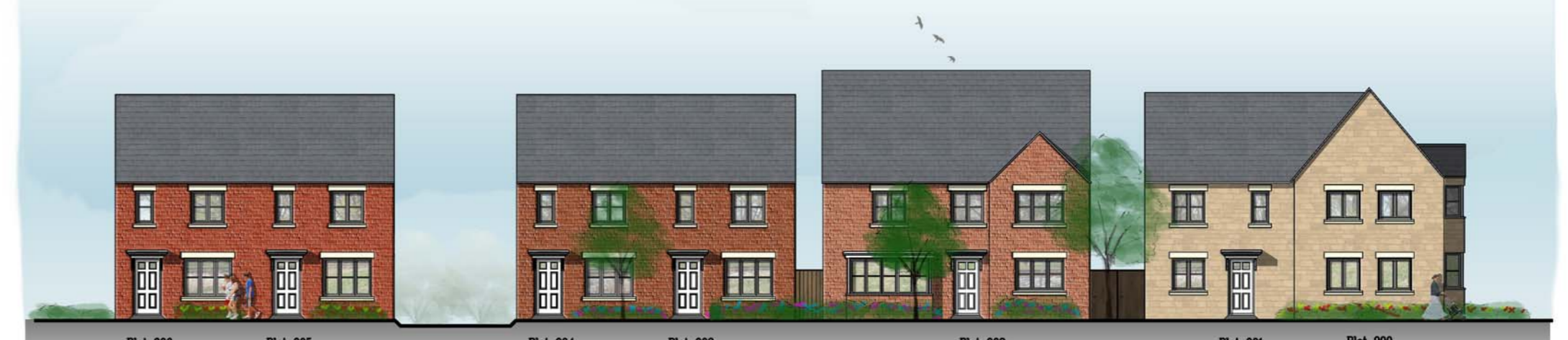
View 5 Plot 966 SP300A Plot 965 SP300A Plot 964 SP300A Plot 963 SP300A Plot 962 SP300A Plot 961 P30CA Plot 960 P30CE