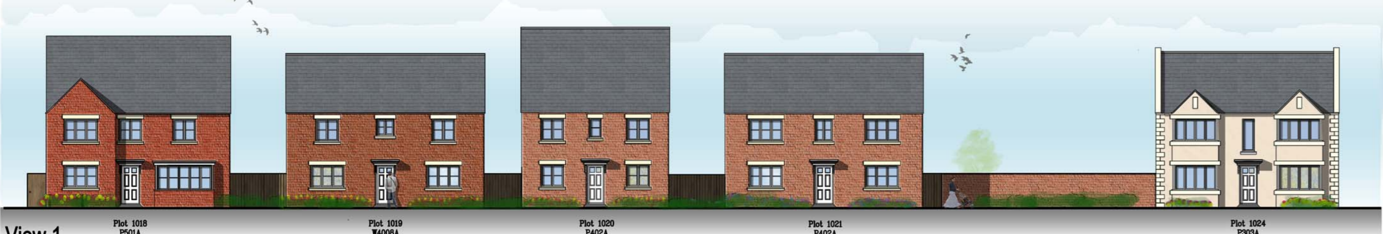
View 1 Plot 1019 P30CA Plot 1018 P4008A Plot 1020 P402A Plot 1021 P402A Plot 1024 P30CA