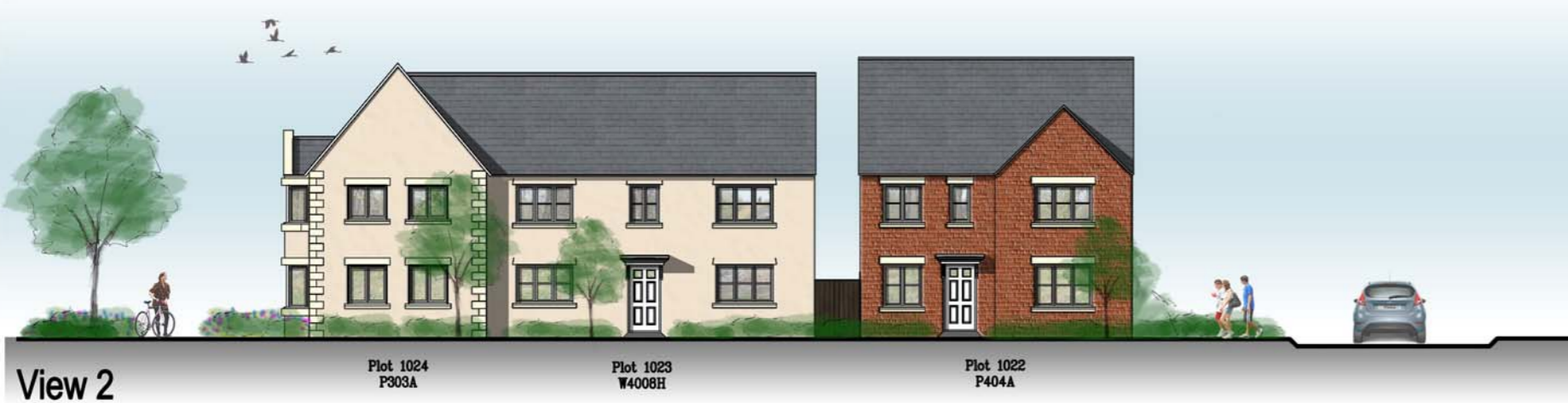
View 2 Plot 1024 P30CA Plot 1025 P4008E Plot 1022 P404A