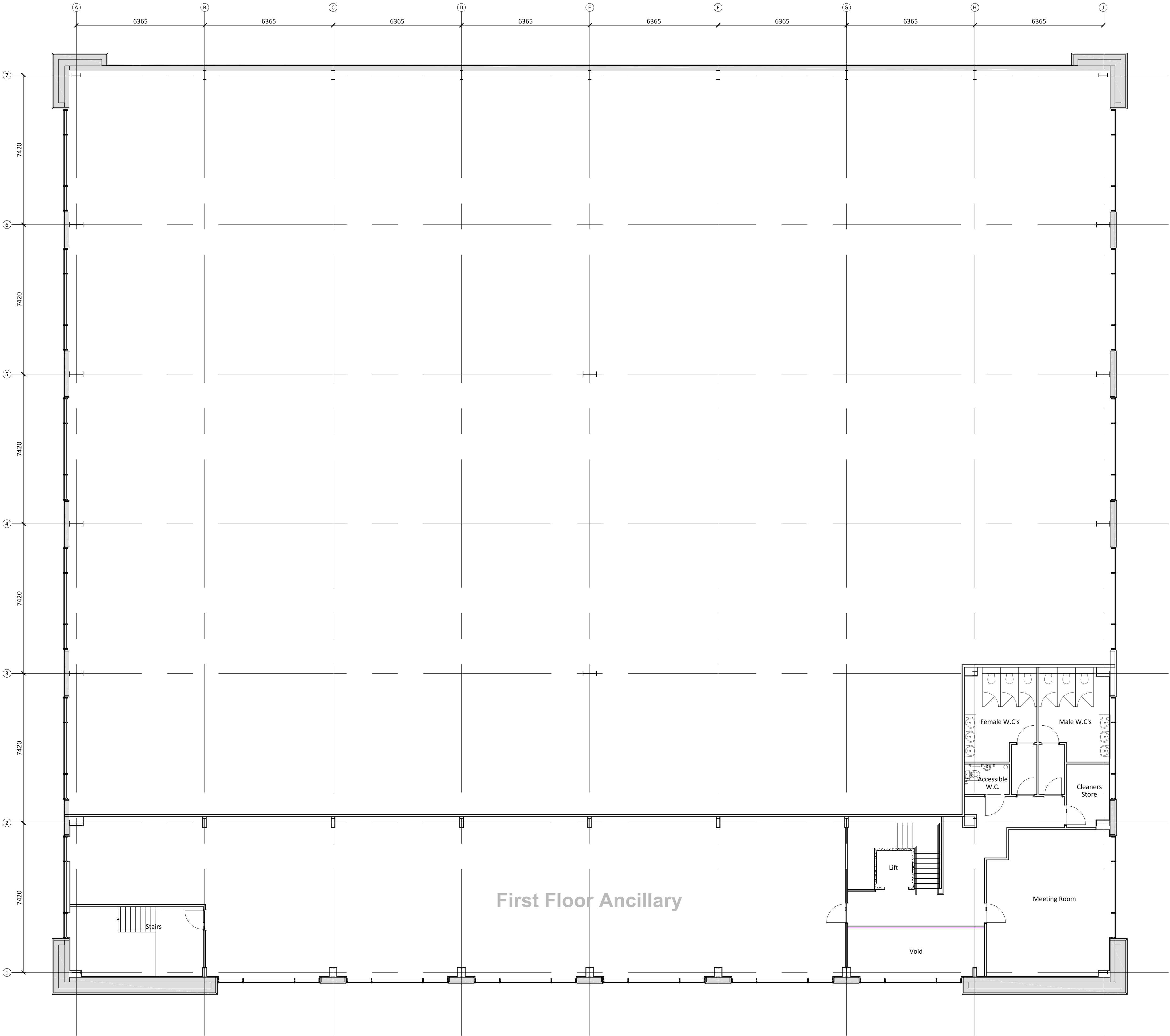
Unit 3 First Floor Plan FFL +0.000