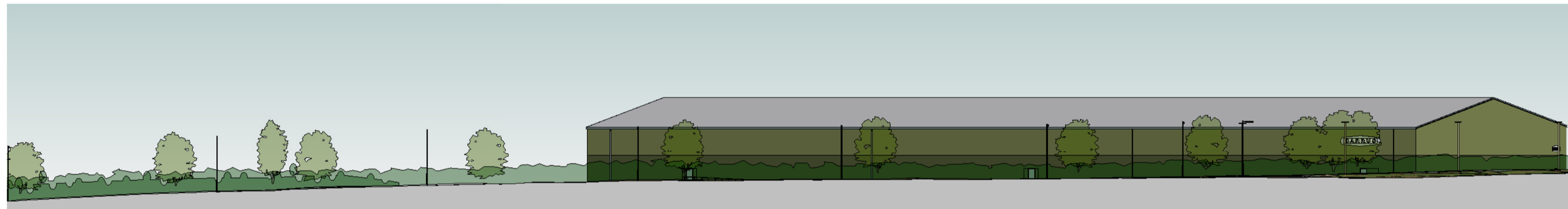
2 | P-13 South Boundary Elevation 1:500