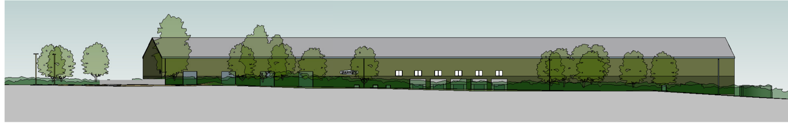
1 | P-13 North Boundary Elevation 1:500