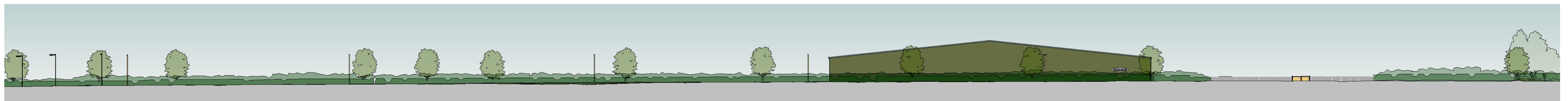
4 | P-13 East Boundary Elevation 1:500