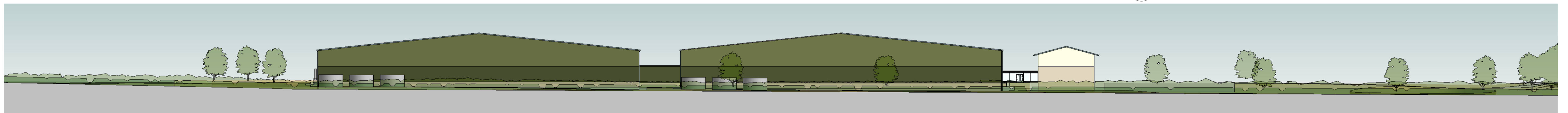
3 | P-23 West Boundary Elevation 1: 500