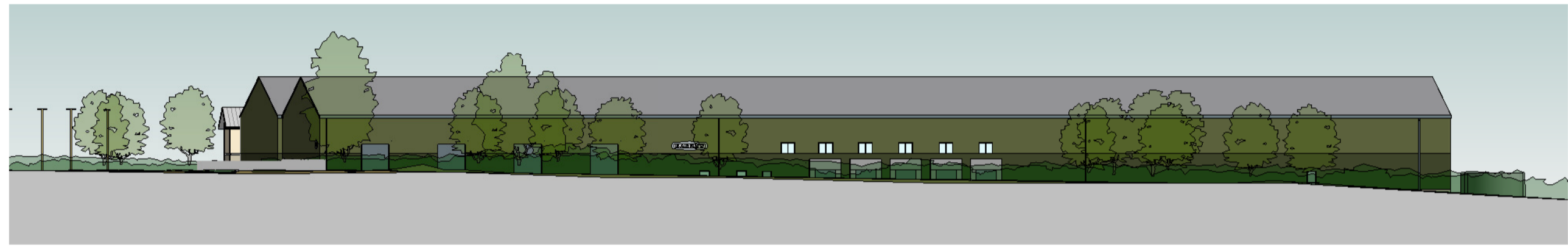
1 | P-23 North Boundary Elevation 1: 500