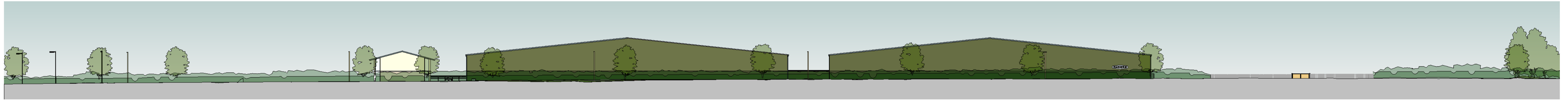
4 | P-23 East Boundary Elevation 1: 500