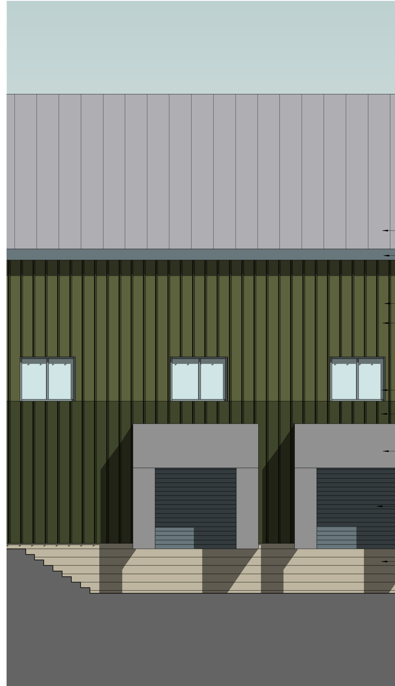
2 | P-15 - Part Elevation - North 1 : 50

indicative signage subject to separate application