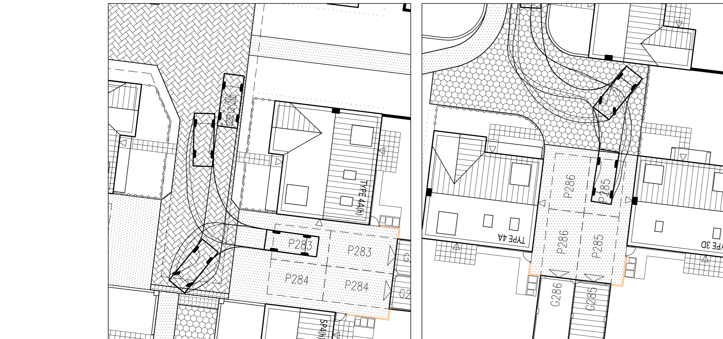
REFUSE VEHICLE TRACKING LAYOUT @ 1:500