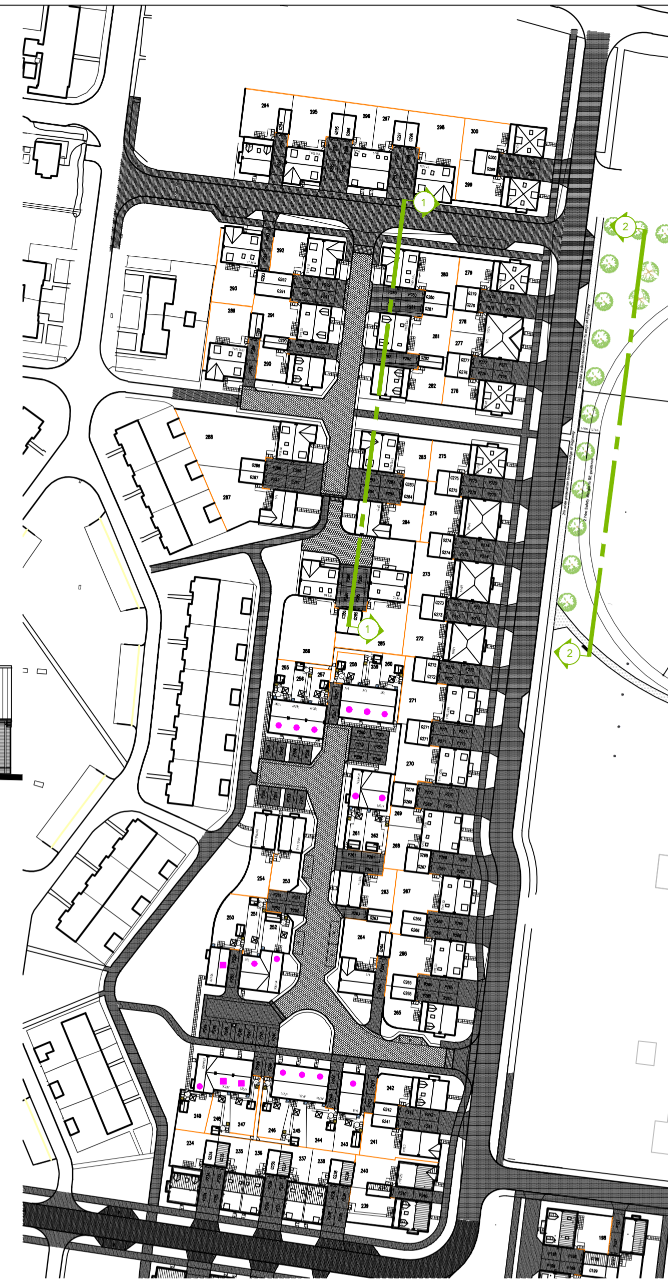
KEY PLAN @ 1:1000 0 5 10 15 20 25 30[m]