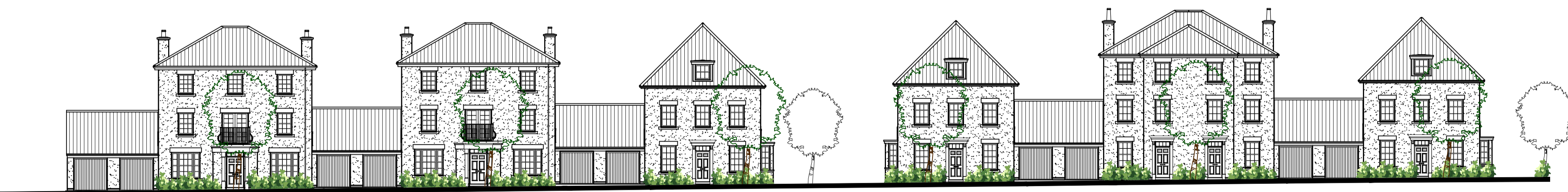
PLOT 273 PLOT 274 PLOT 275 PLOT 276 PLOT 277 PLOT 278 PLOT 279 STREET SCENE 2 - VILLAGE GREEN