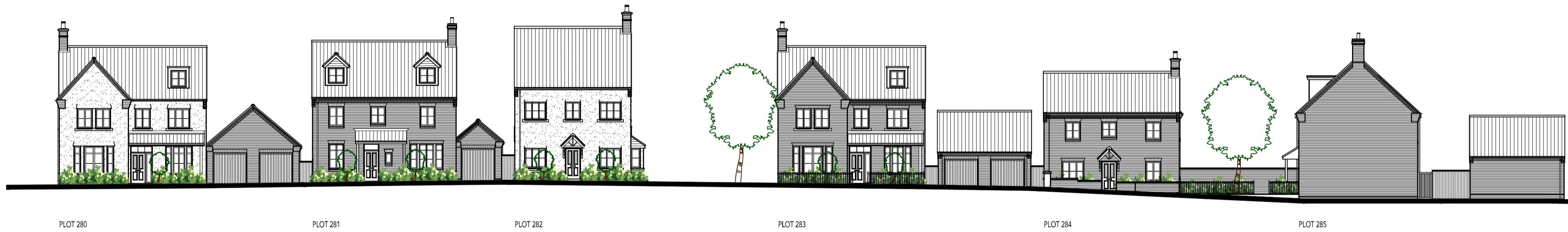
PLOT 280 PLOT 281 PLOT 282 PLOT 283 PLOT 284 PLOT 285 STREET SCENE 1 - CORE HOUSING EAST