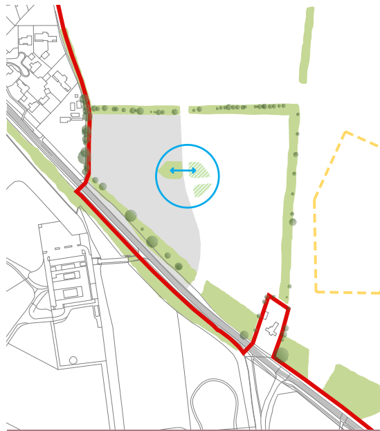
FIG. 136 | PRINCIPLES

A central open green space provides a community focus for the site and offers opportunities to integrate the landscape with the entrance to the Care Village site opposite. This integration creates a safe place for children to play and a safe and attractive pedestrian and cycle route. This is more direct than the route available to vehicles and links to the local centre, encouraging sustainable and healthy travel.