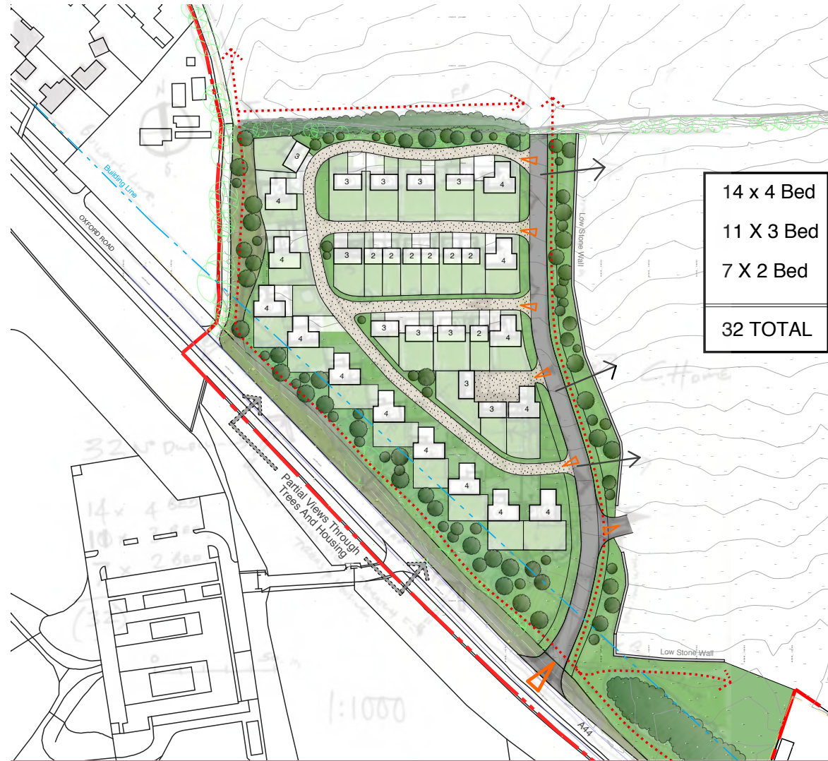
FIG. 139 | INITIAL SITE LAYOUT

A notional building line for the dwellings alongside Oxford Road (A44) was established to provide an adequate space for a landscape strip incorporating a new tree belt behind the existing retained hedge, in-keeping with the building line further along Oxford Road (A44).