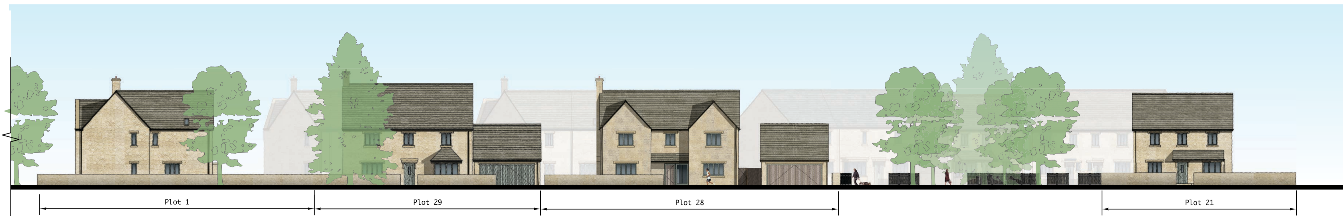
View from main street / Care Village