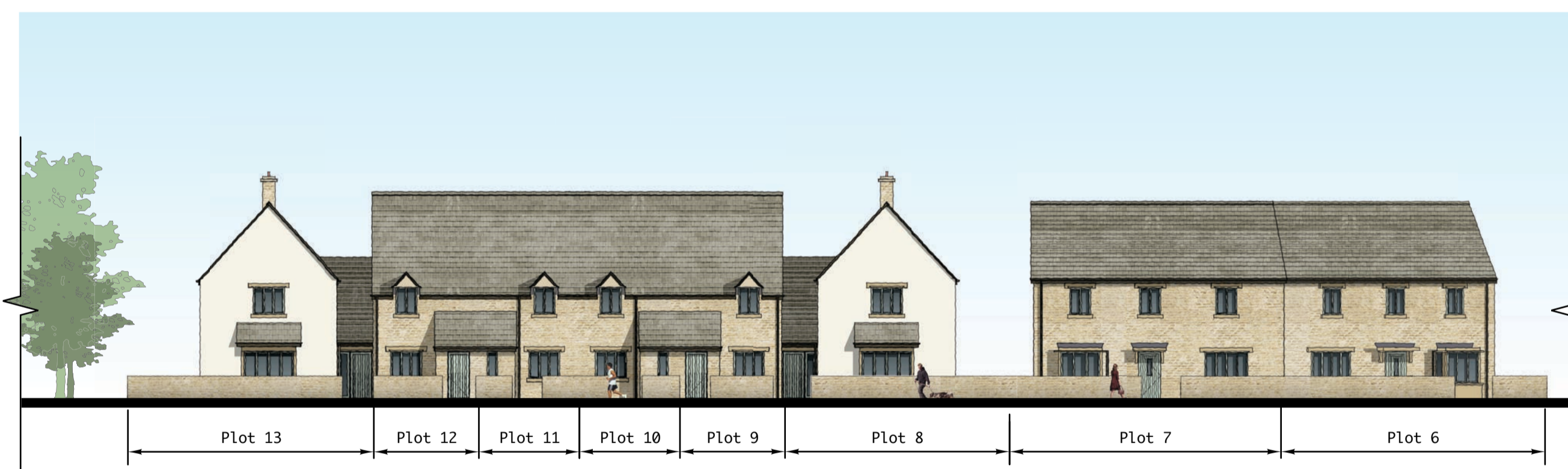
View of plots 6-13 from west footpath