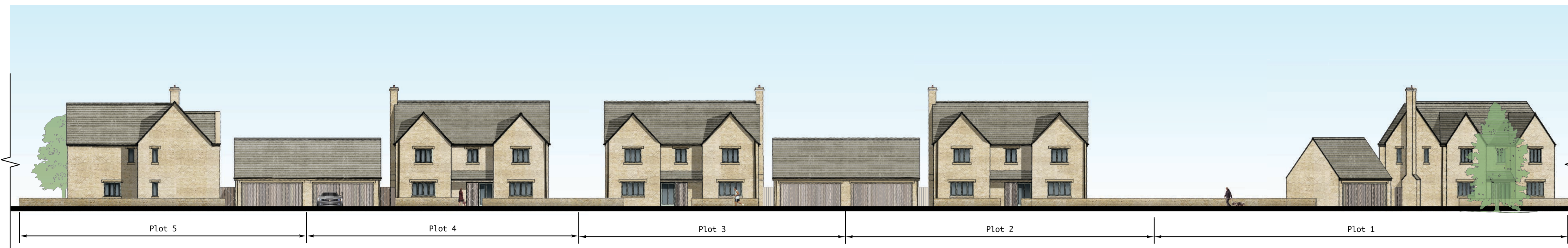
View of plots 1-5 from footpath

This drawing is the copyright of West Waddy : ADP and may not be copied or reproduced without written permission. The Copyright Order 1990 provides for the Planning Authority to copy and distribute drawings for public inspection in relation to a Planning Application only if those copies are marked in the following manner: "This copy has been made with the authority of West Waddy: ADP pursuant to Section 47 of the Copyright Designs and Patents Act 1988 and for the purposes only of public inspection. This copy must not be copied without the prior written permission of the Copyright owner." Do not scale from drawings unless for planning purposes only. Use figured dimensions at all other times. In case of doubt contact West Waddy:ADP Dimensions to be checked on site before work commences and any discrepancies reported to the Architect. The accuracy of this drawing may be reliant upon survey information provided by third parties. No liability will be accepted by WestWaddy:ADP for errors in or arising from such third party survey information.