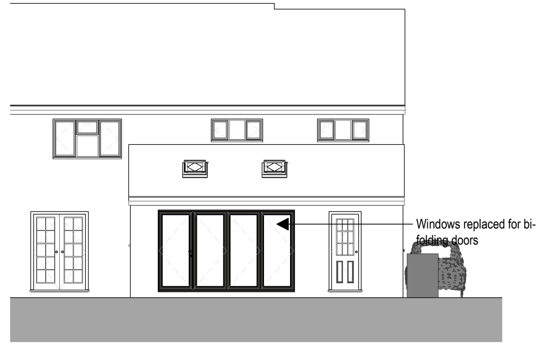
2 3201 East Elevation 1 : 100