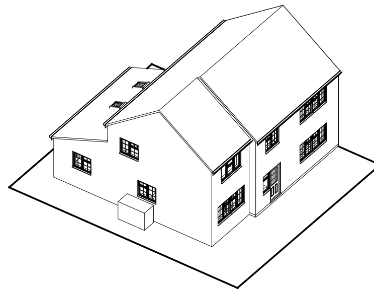
2 9001 AXO 02 - PROPOSED