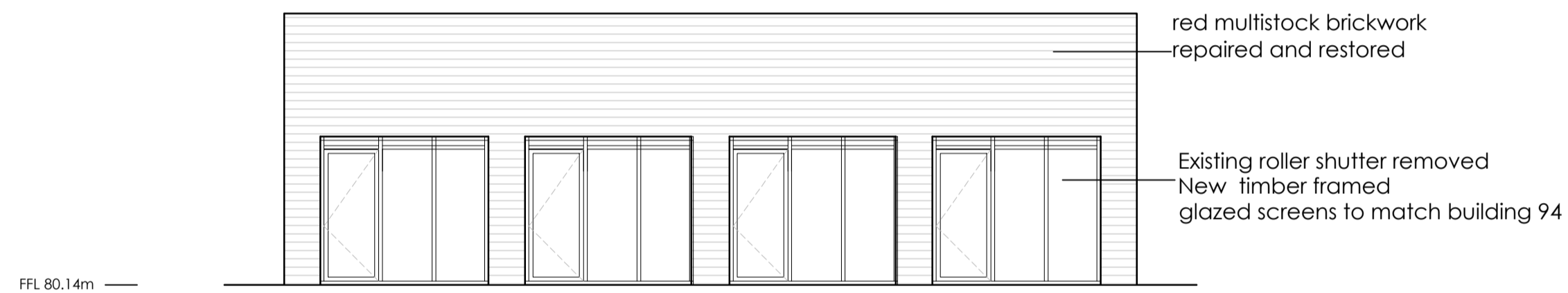
BUILDING 116 North East Elevation-Proposed