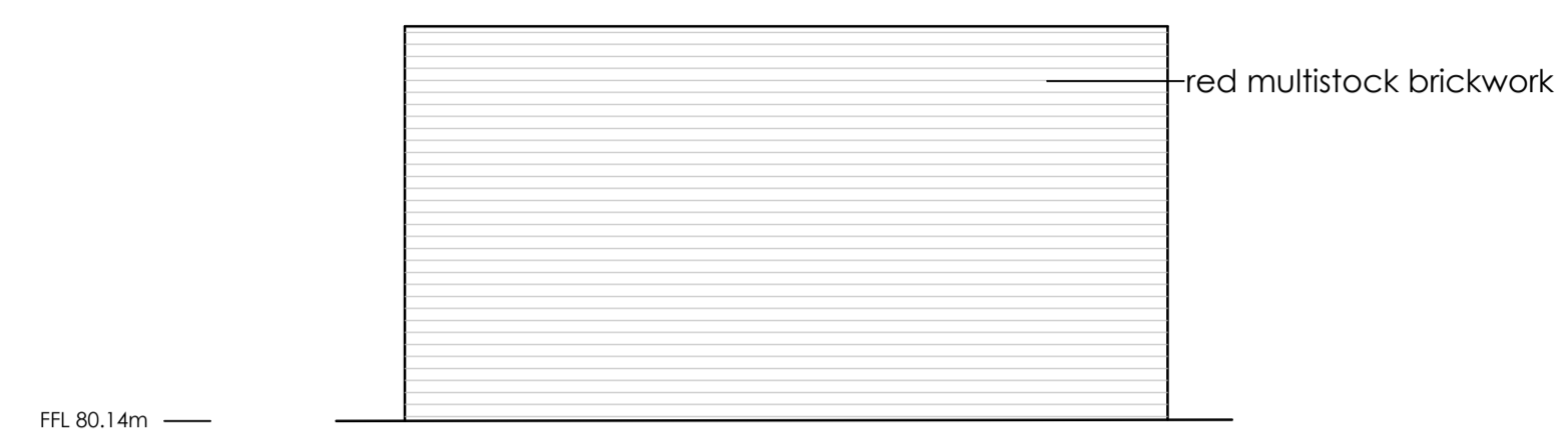
BUILDING 116 South east Elevation/North west elevation - Existing