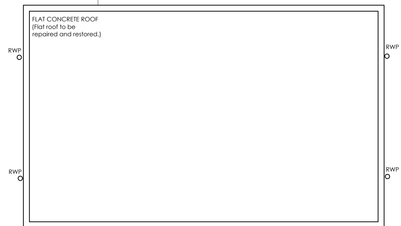
BUILDING 116 Proposed Roof Plan