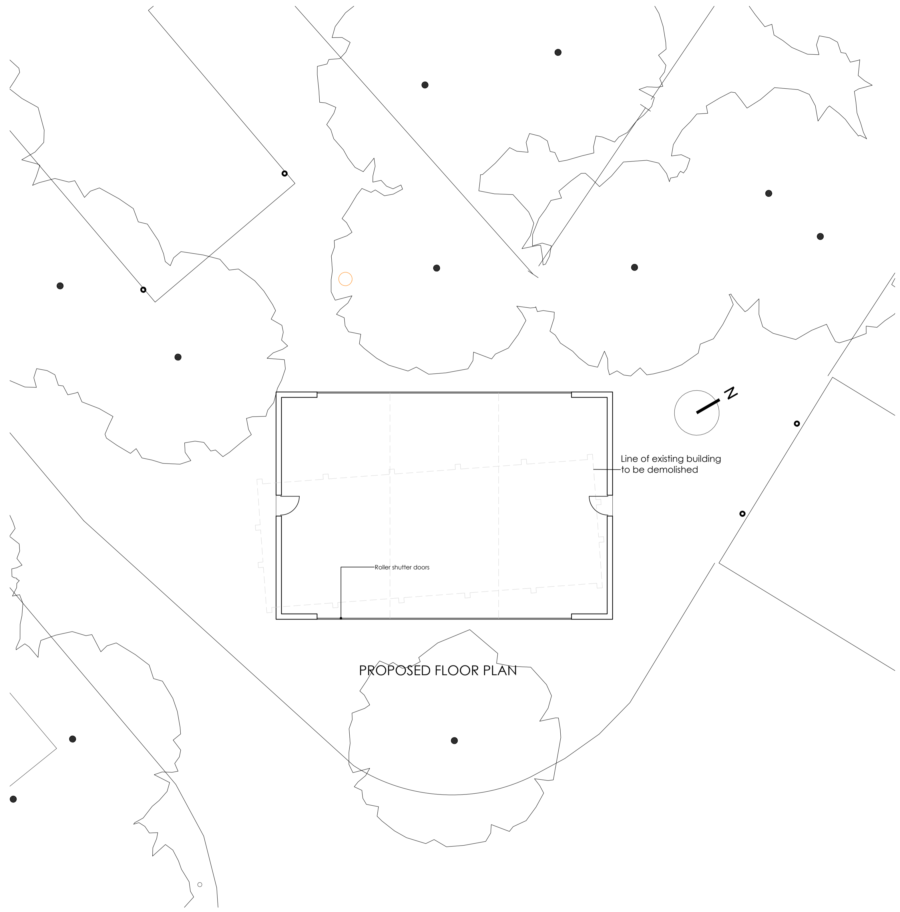
PROPOSED FLOOR PLAN