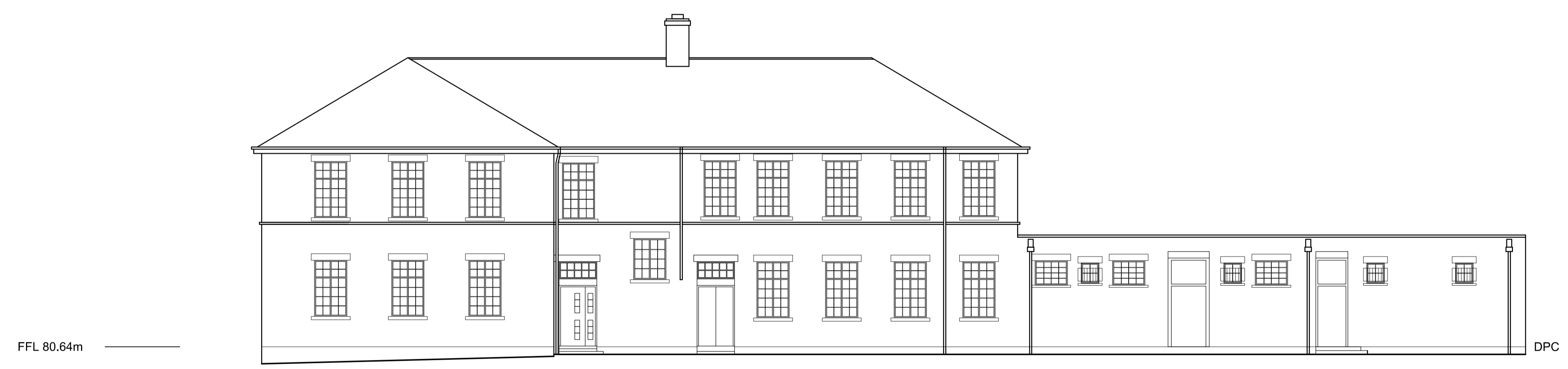
BUILDING 123 SOUTH ELEVATION - EXISTING Note: Elevation of windows indicative only