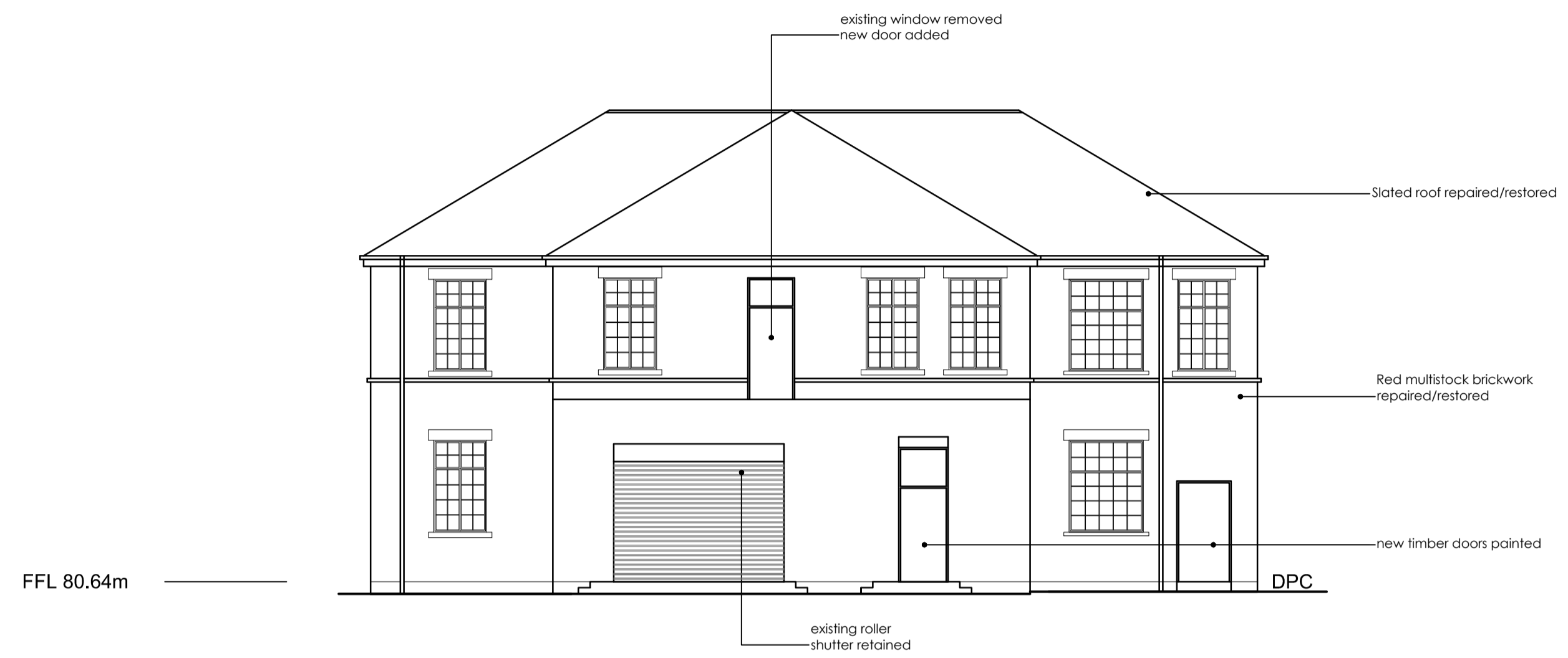
BUILDING 123 EAST ELEVATION - PROPOSED Note: Elevation of windows indicative only