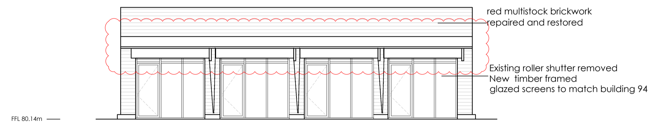
BUILDING 116 South West Elevation-Proposed