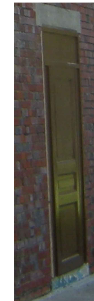
Existing hardwood door on Building 147