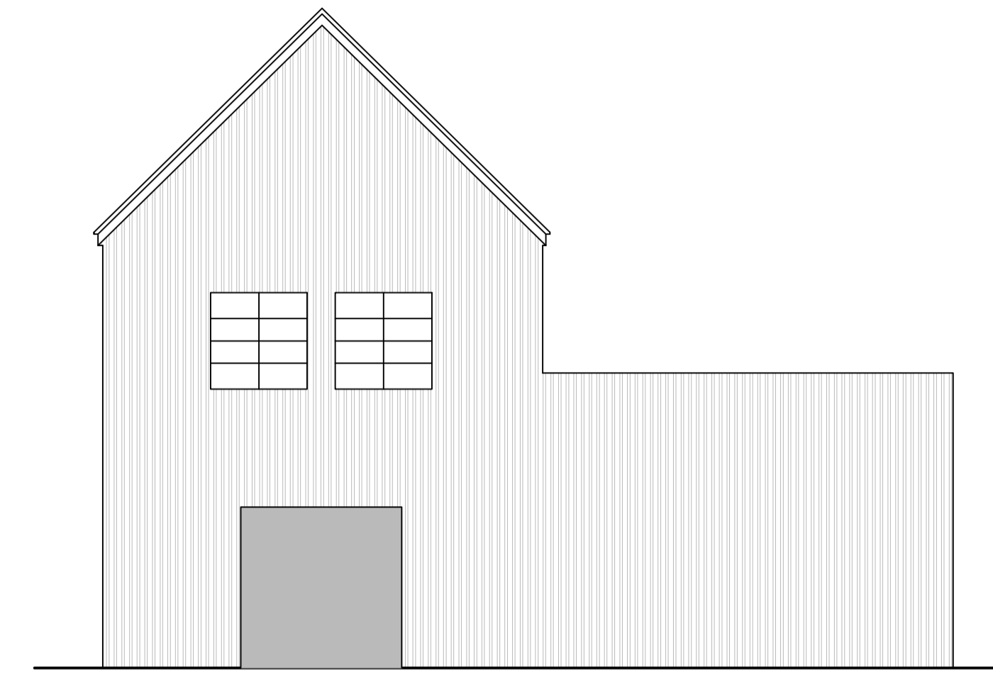
BUILDING 101 PROPOSED East Elevation