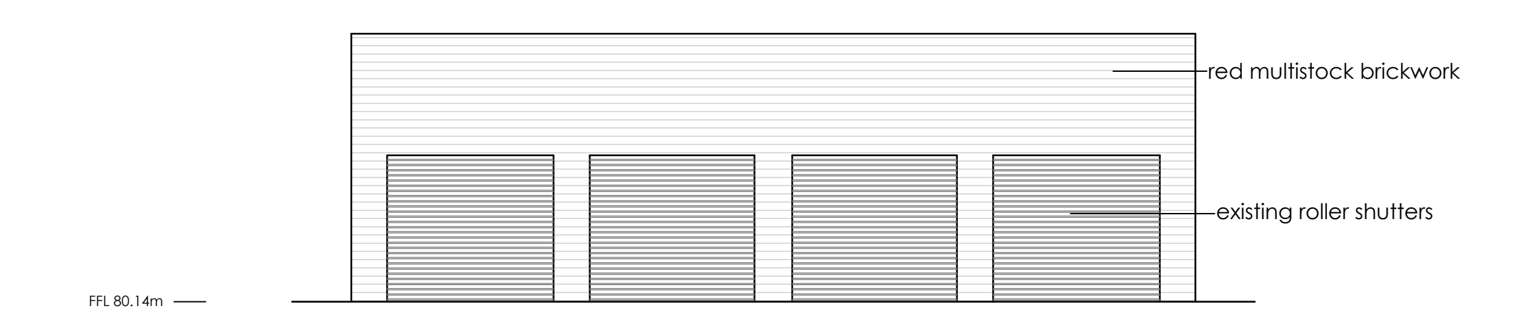
BUILDING 116 South West Elevation/North East Elevation - Existing