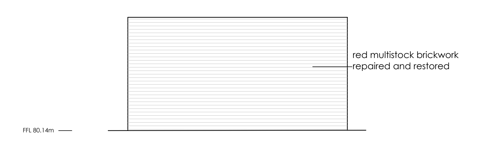
BUILDING 116 South east Elevation/North west elevation - Proposed

This drawing is copyright, All rights described in Chapter IV of the Copyright, Designs and Patents Act 1988 have generally been asserted dimensions to be checked on site. Do not scale. Any discrepancy between this drawing and other information to be reported to GFA, drawing shows Design Intent Only.