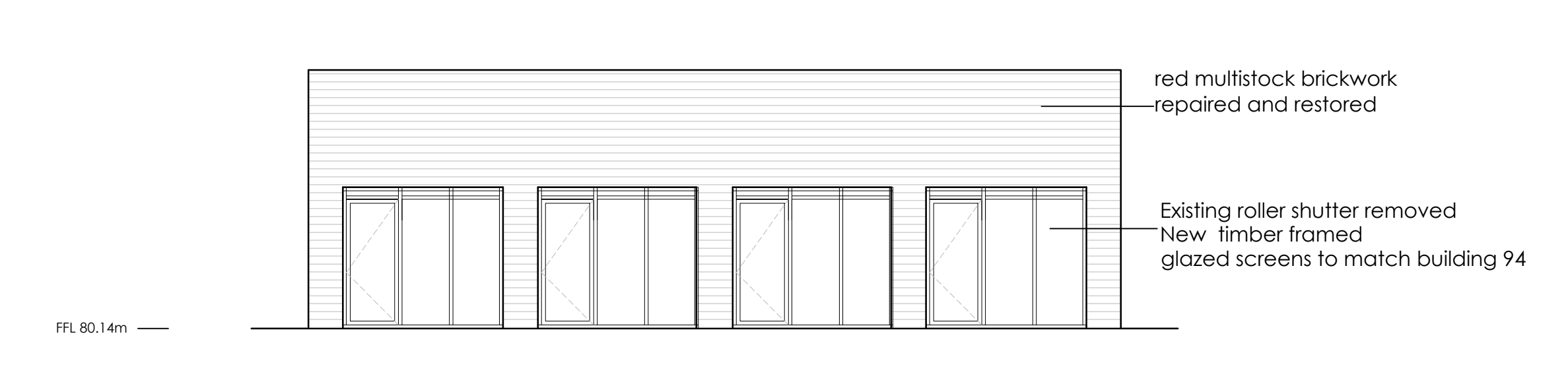
BUILDING 116 North East Elevation-Proposed