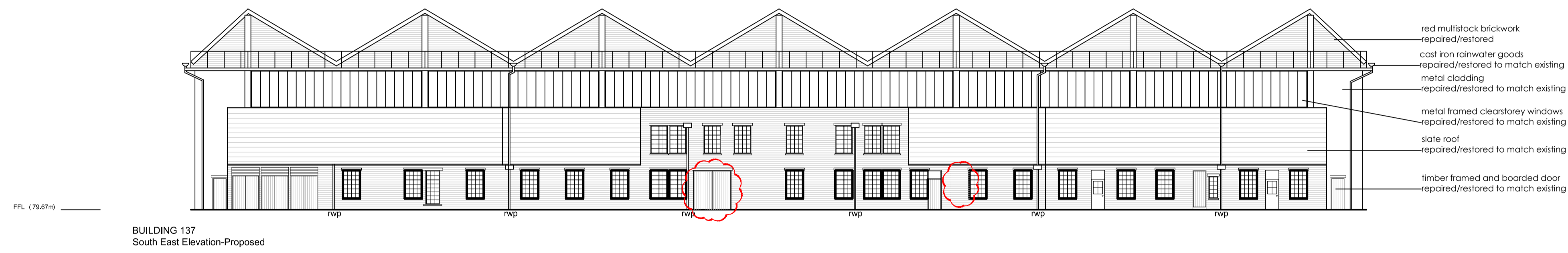
BUILDING 137 South East Elevation-Proposed