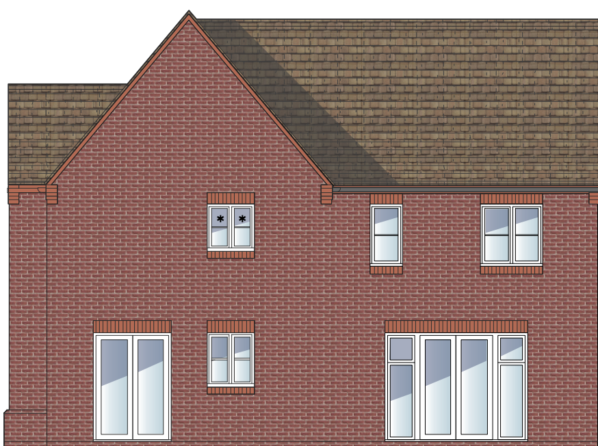
FRONT ELEVATION P302A SIDE ELEVATION P303A