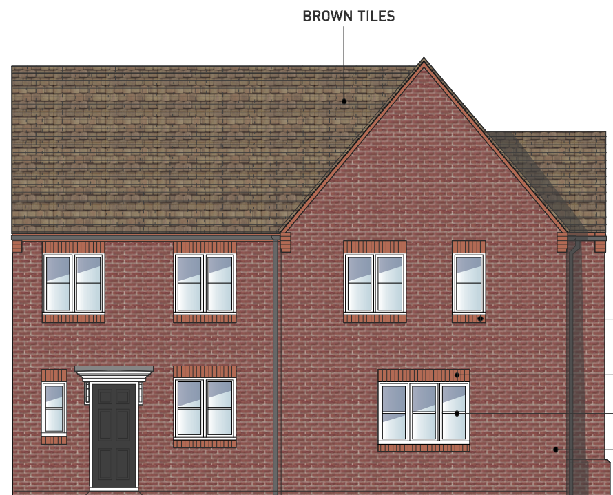
FRONT ELEVATION P302A SIDE ELEVATION P303A

© Copyright Pegasus Planning Group Ltd. © Crown copyright. All rights reserved. Ordnance Survey Copyright Licence number 100042093. Promap Licence number 100020449. Standard OS licence rights, one year from purchase. Drawings prepared for planning application purposes and can be scaled. Drawings are not to be used for construction or sales documents. Pegasus Urban Design is part of Pegasus Planning Group Ltd. Any queries to be reported to Pegasus for clarification.