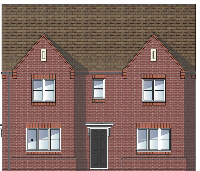
FRONT ELEVATION P303A