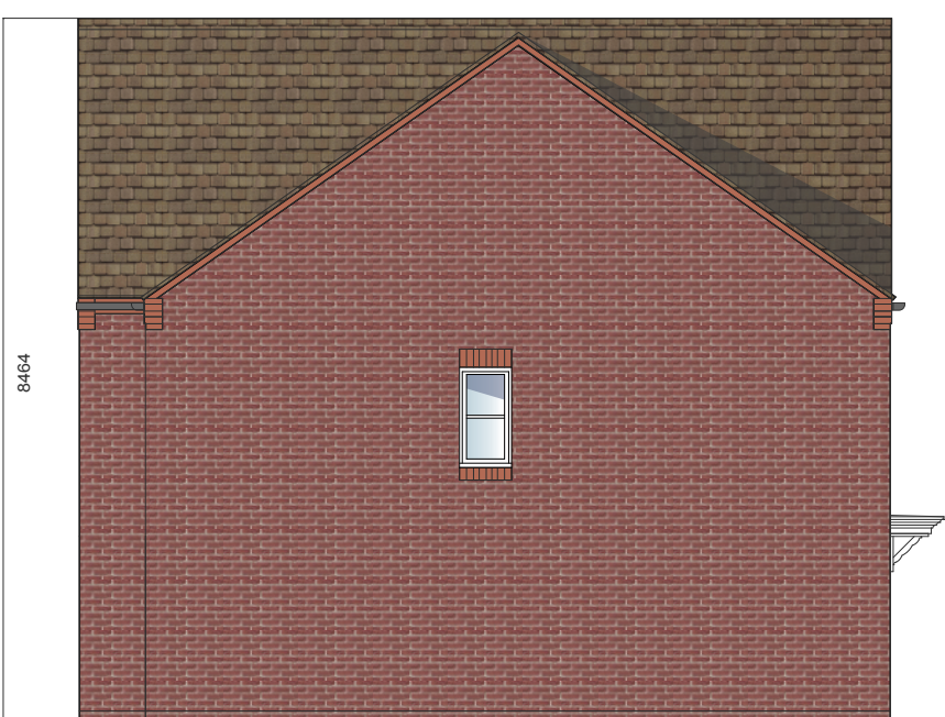
SIDE ELEVATION P302A