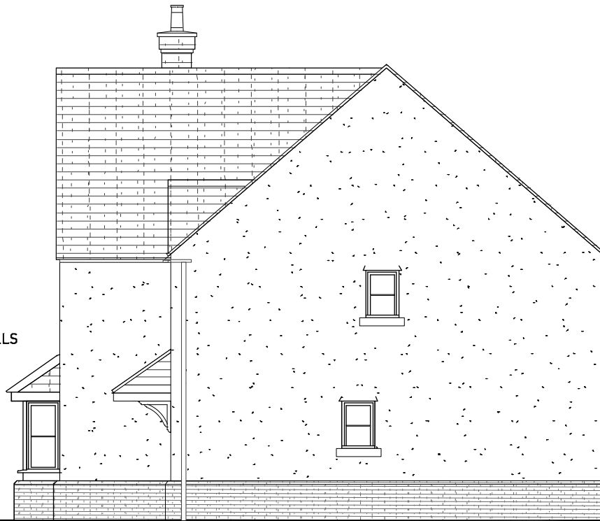
SIDE ELEVATION (A)