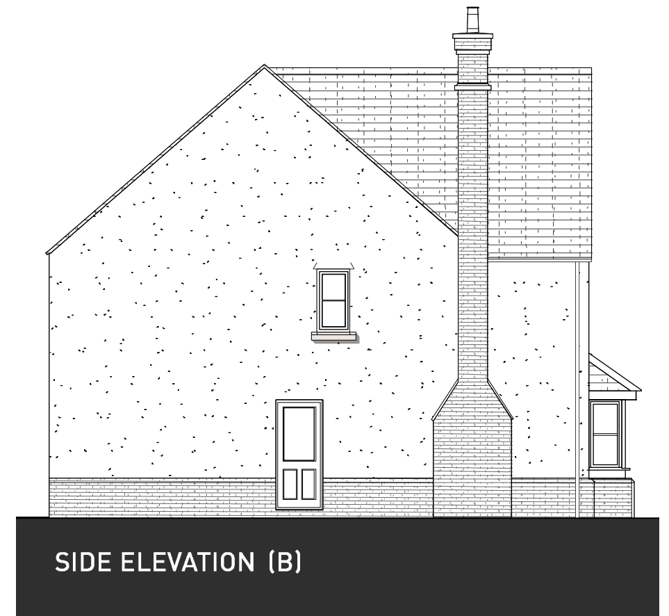
SIDE ELEVATION (B)