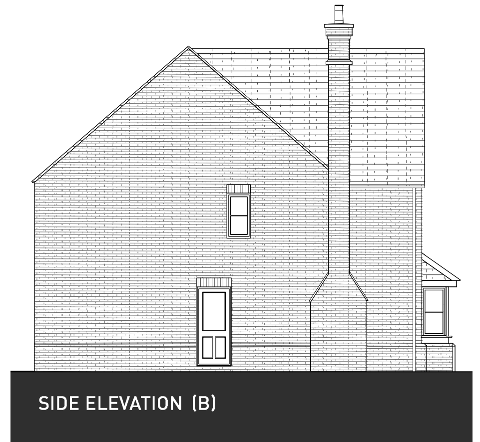
SIDE ELEVATION (B)