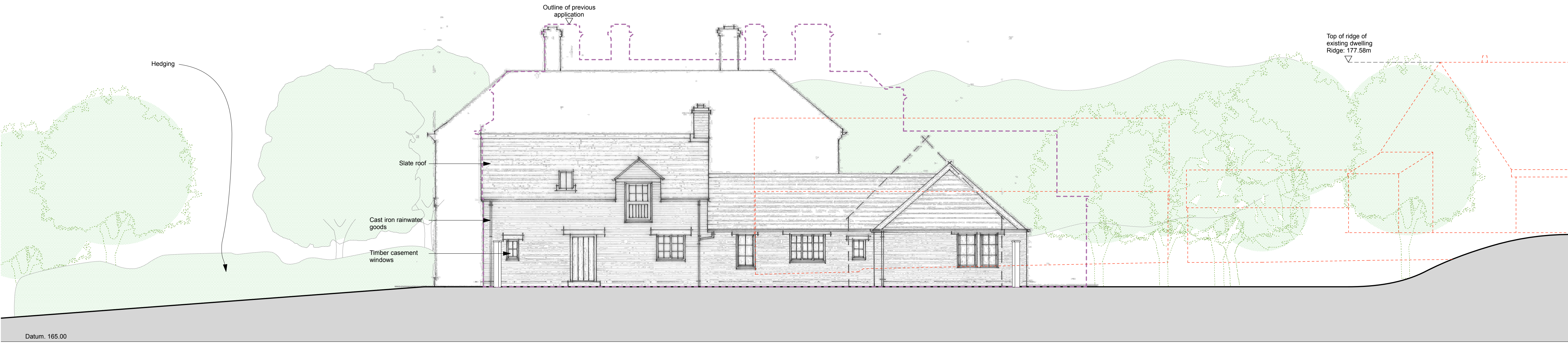
4: East Elevation