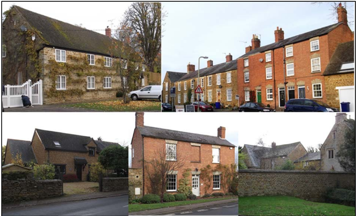
Architectural Vernacular of Deddington