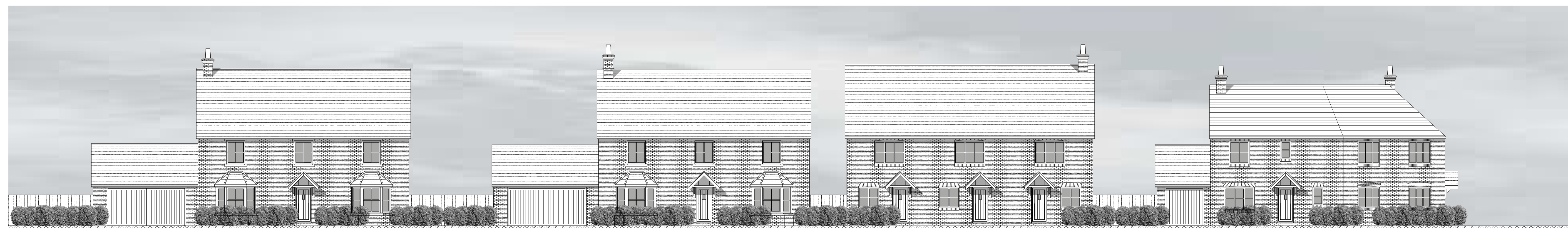
Plot 12a Plot 14 Plot 15-17 Plot 18 Plot 19