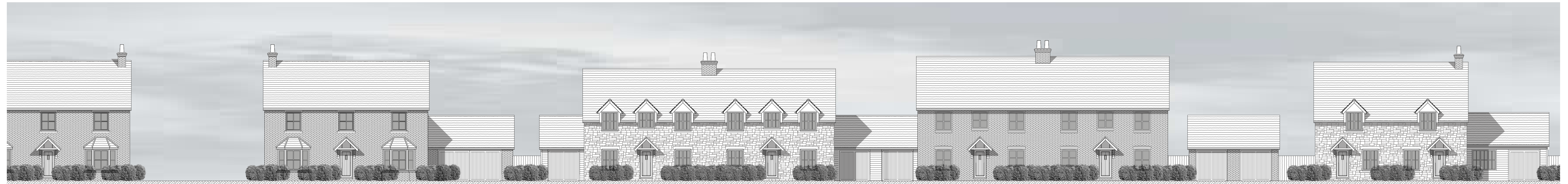
Plot 1 Plot 20 Plot 21 Plot 22 Plot 23 Plot 24 Plot 25 Plot 26