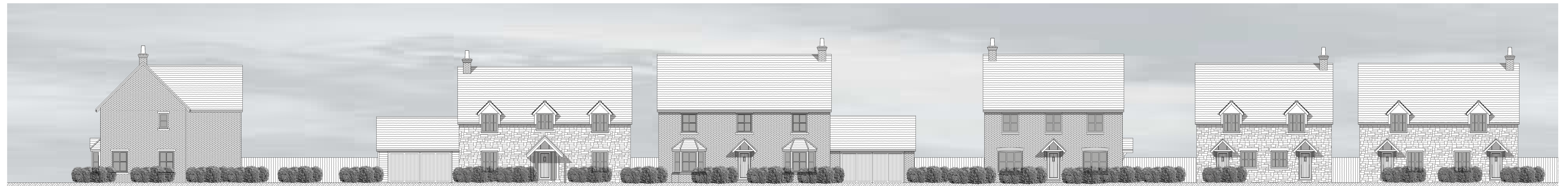
Plot 1 Plot 2 Plot 3 Plots 4-5 Plot 6 Plot 7 Plot 8 Plot 9