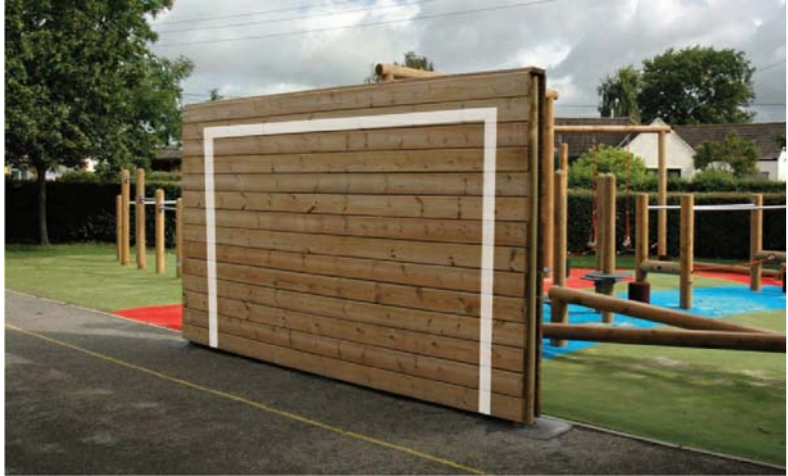
Kickabout Area. 1. Football rebound wall, supplied by Playforce or similar approved. 3600 x 2035 x 195mm timber construction with goal markings. Footings to manufacturers design and specification.