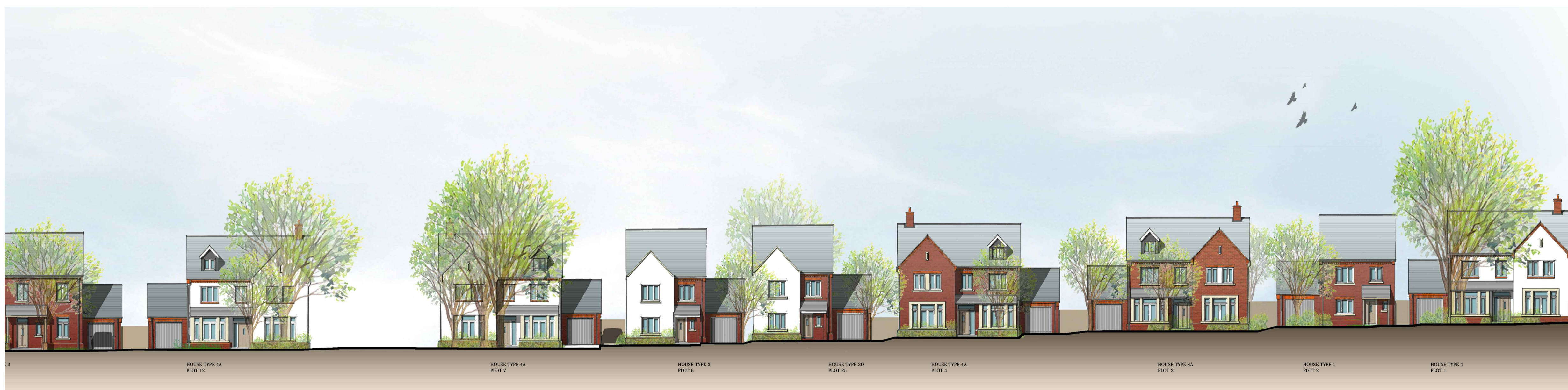
ELEVATION A-A Part 2