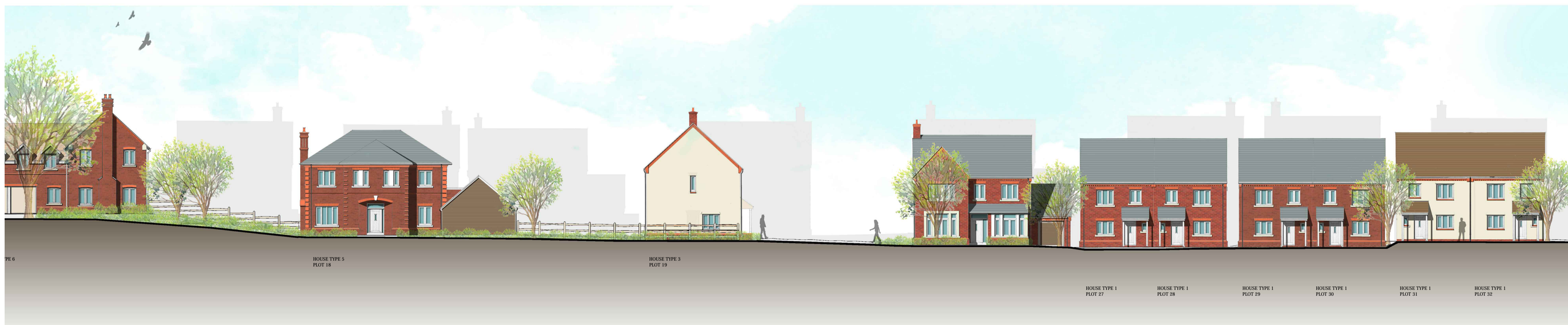
ELEVATION B-B PART 2