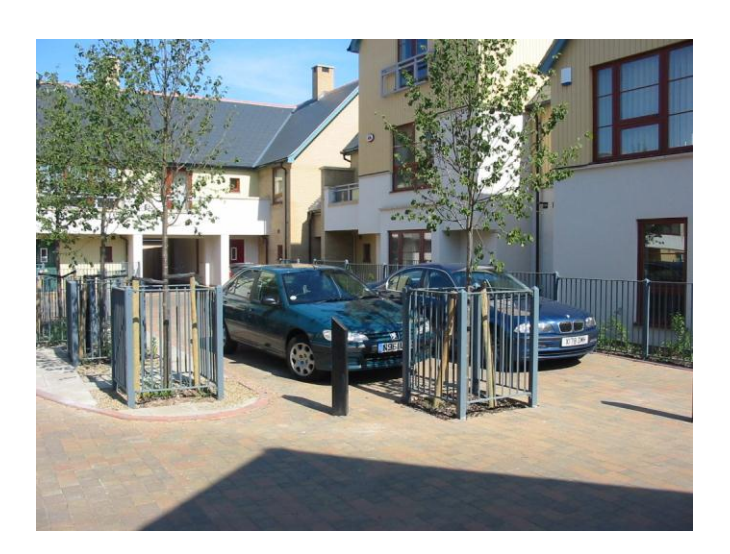
The result of a missing bollard or poor design? (designs have to eliminate poor parking habits)