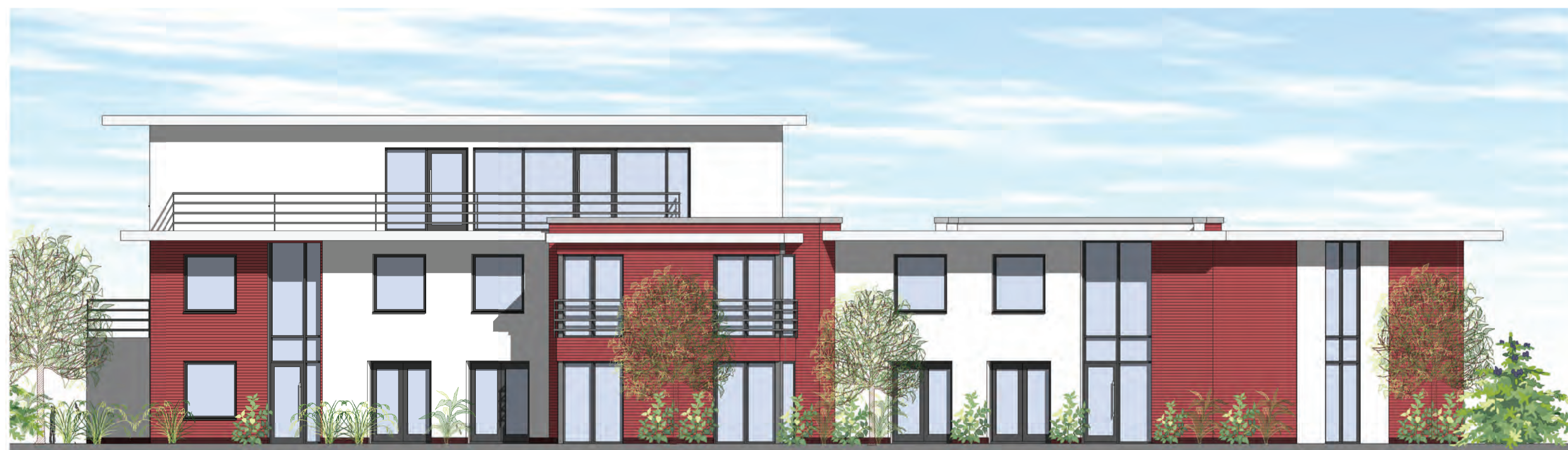
4 Elevation D 1:100