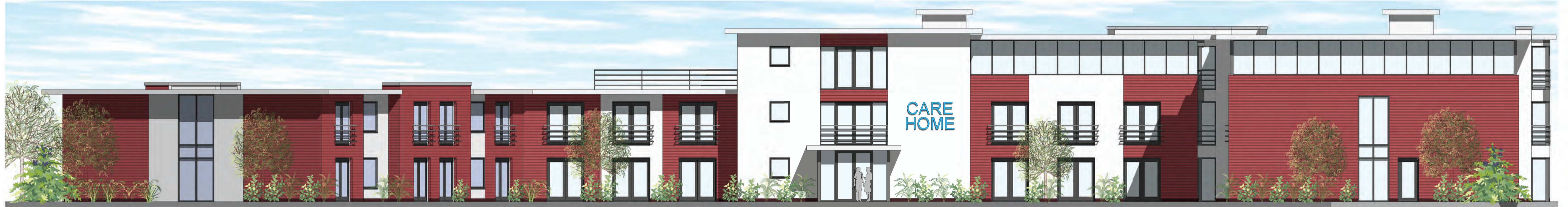
1 Elevation A 1:100