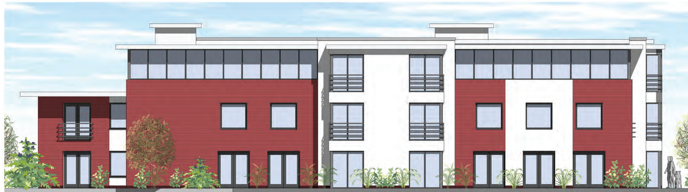
3 Elevation B 1:100