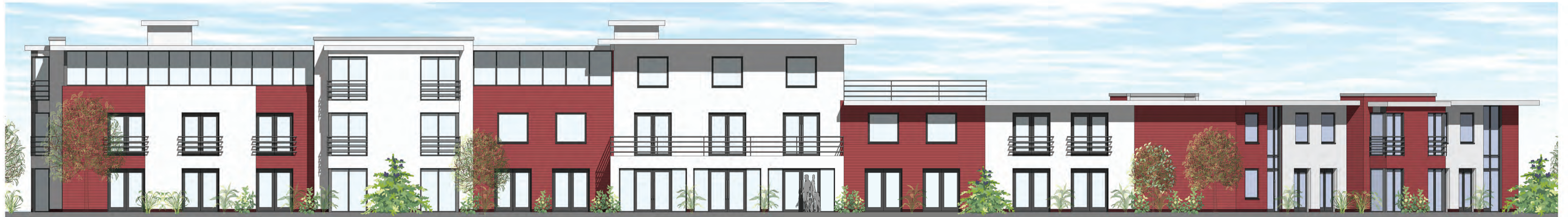
2 Elevation C 1:100