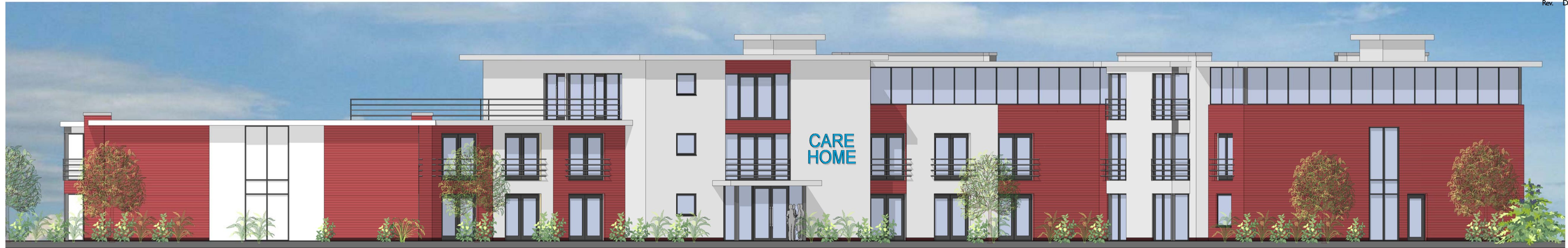
2 Elevation F 1:100