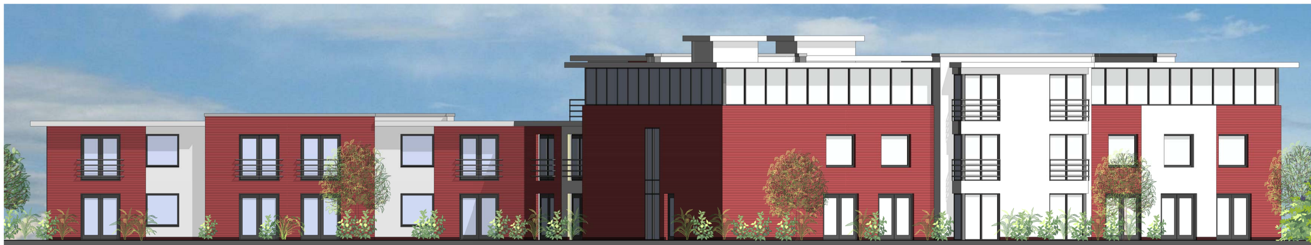
3 Elevation G 1:100