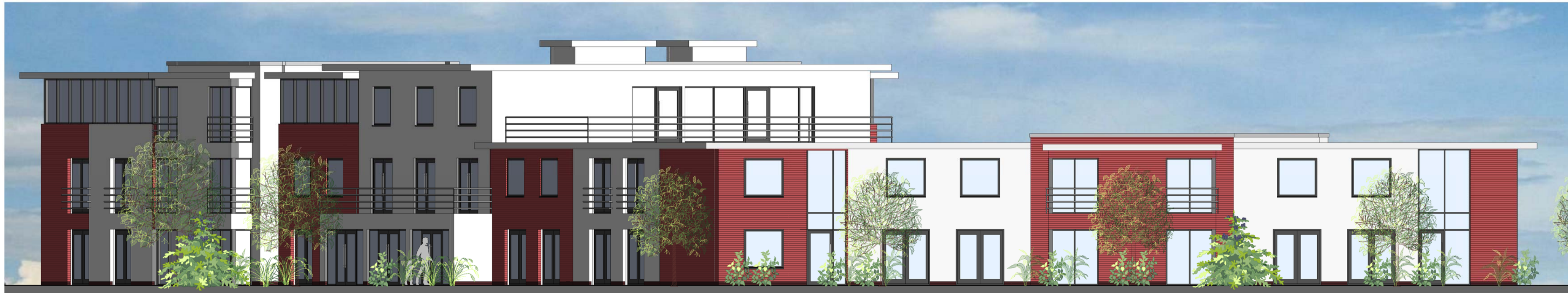
1 Elevation E 1:100