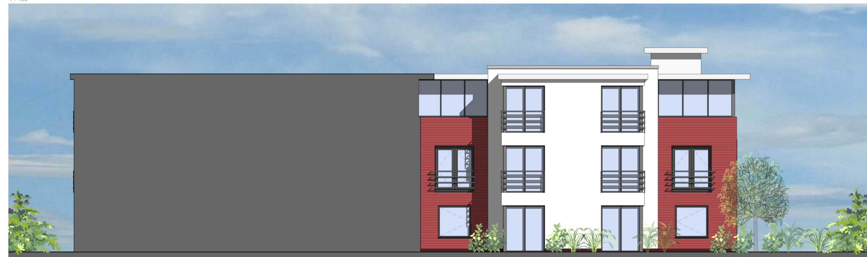
4 Elevation H 1:100