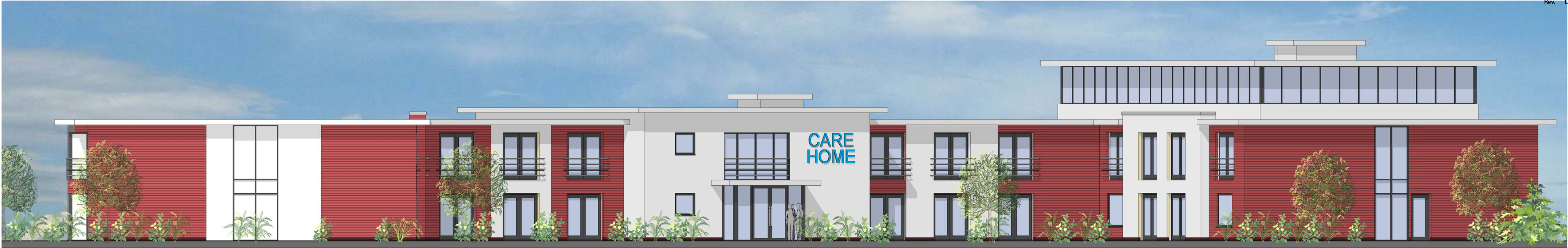
2 Elevation F 1:100