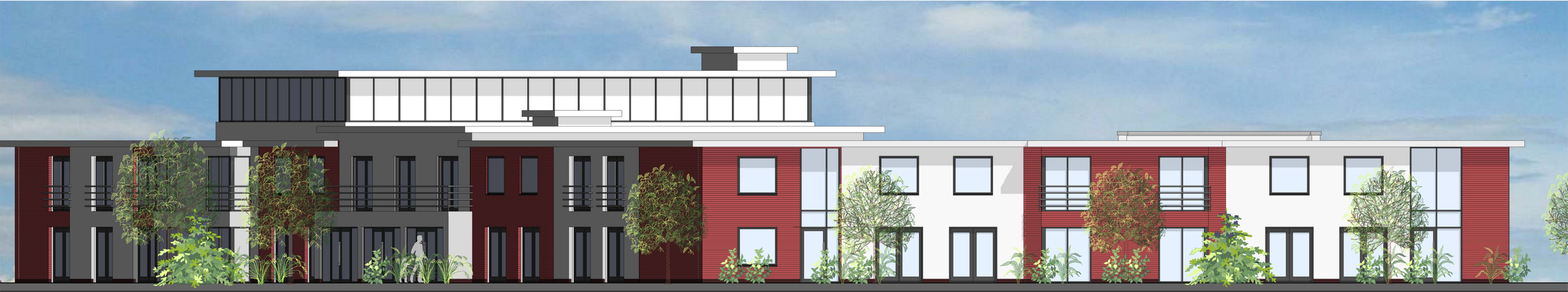
1 Elevation E 1:100