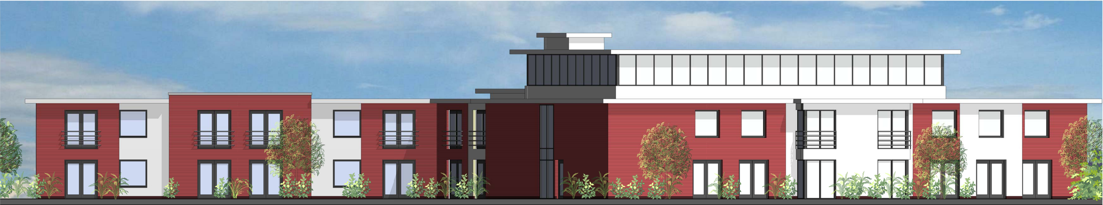
3 Elevation G 1:100