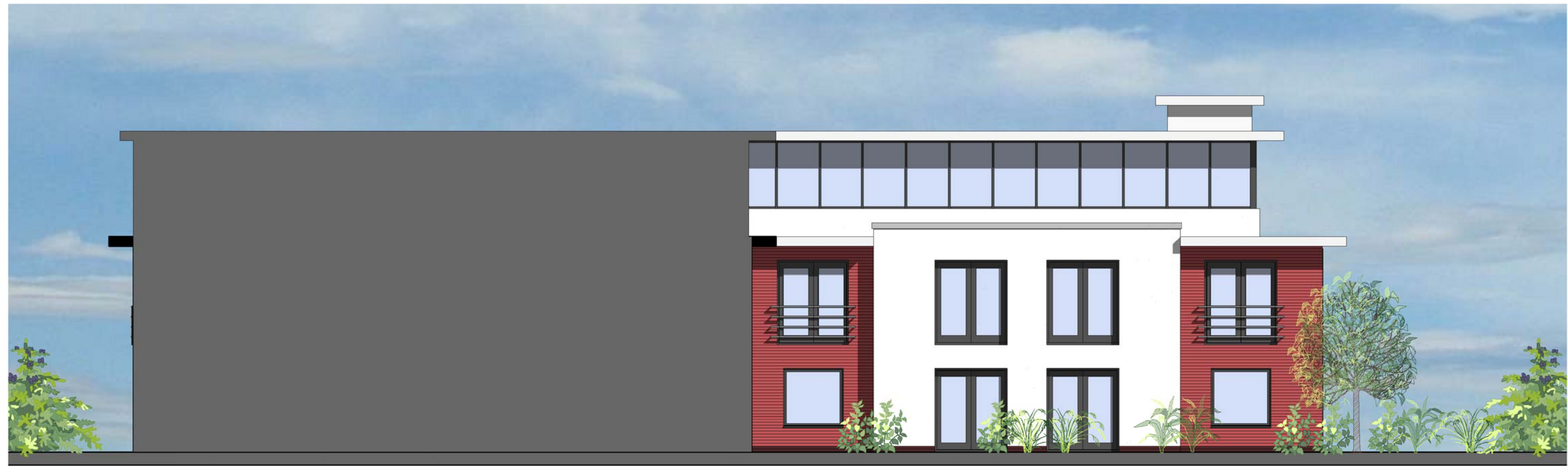
4 Elevation H 1:100