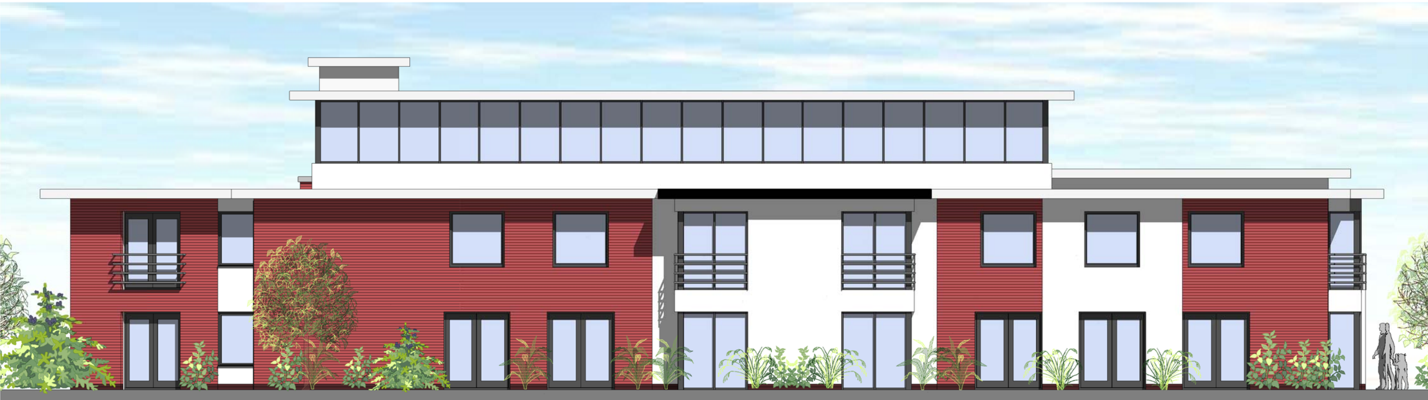
3 Elevation B 1:100