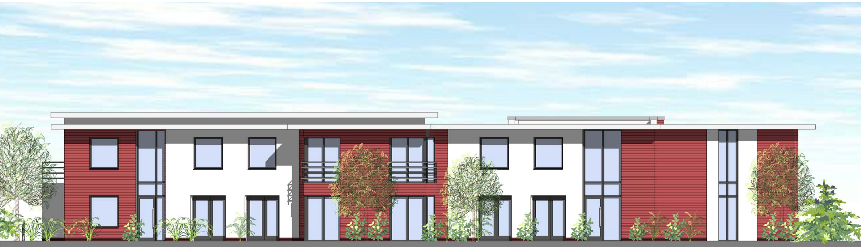
4 Elevation D 1:100