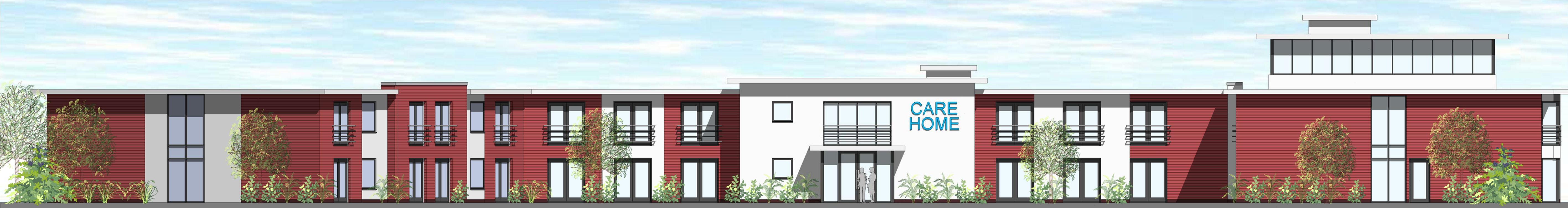
1 Elevation A 1:100