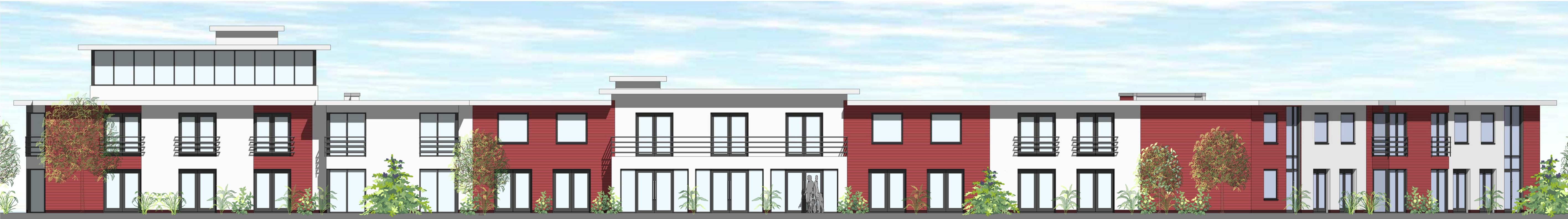
2 Elevation C 1:100