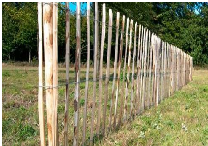
Figure 3. Tree Protection fencing example

The system illustrated in Figure. 3 is adequate to define areas of protected vegetation and exclude traffic, and comprises Cleft Chestnut Pale Fence in accordance with BS 1722 Part 4: (1991). Assembled with galvanized 14 gauge (2 mm) wire, four strands per row, peeled and pointed one end. Approximate spacing of pales 75 mm.