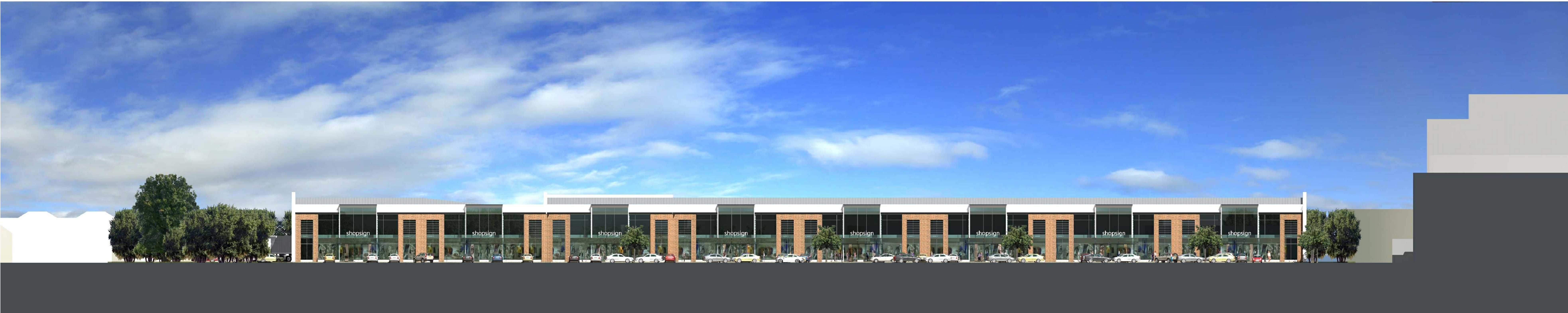
B - EAST ELEVATION - TO RETAIL TERRACE