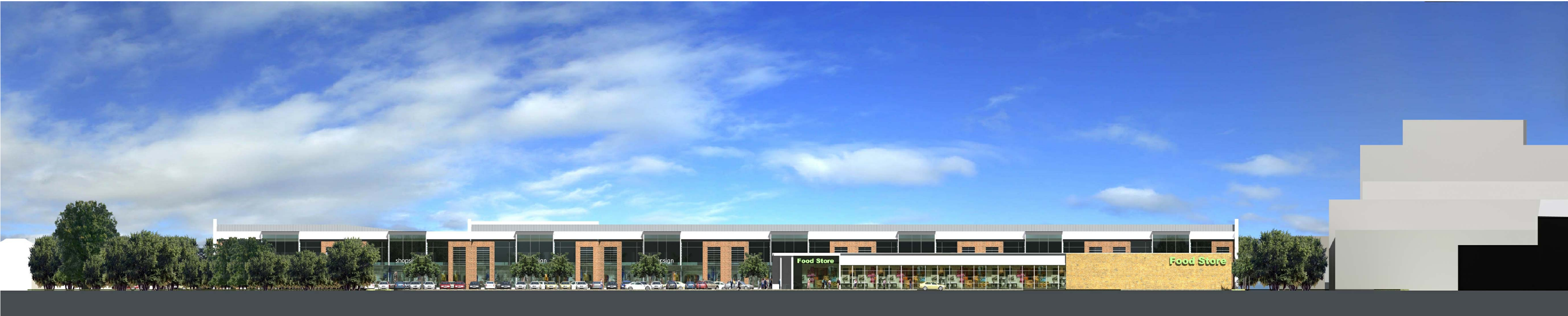
C - EAST ELEVATION - TO FOOD STORE

The copyright of this drawing is vested with Corstorphine & Wright Ltd and must not be copied or reproduced without the consent of the company. Figured dimensions only to be taken from this drawing. DO NOT SCALE. All contractors must visit the site and be responsible for checking all setting out dimensions and notifying the architect of any discrepancies prior to any manufacture or construction work. NOTES: Metres 0 2.5m 5m 7.5m 10m 12.5m Centimetres 0 10m 20m 30m 40m 50m