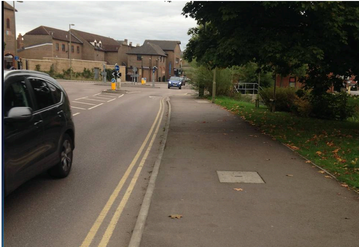
Figure 2.1 - Approximate location of second bus stop along Manorsfield Road