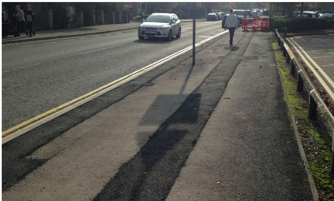
Figure 3.4 – New pedestrian route into Bicester Village Railway Station via London Road