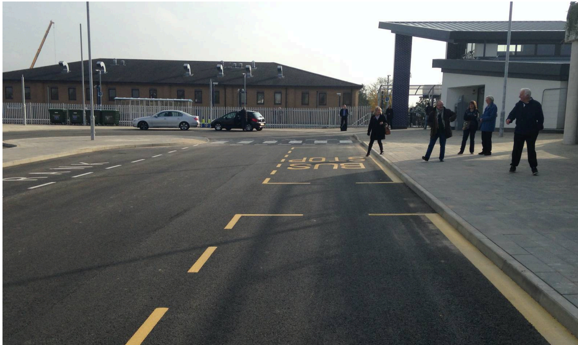
Figure 3.1 – Bus pick / drop off area within Bicester Village Railway Station