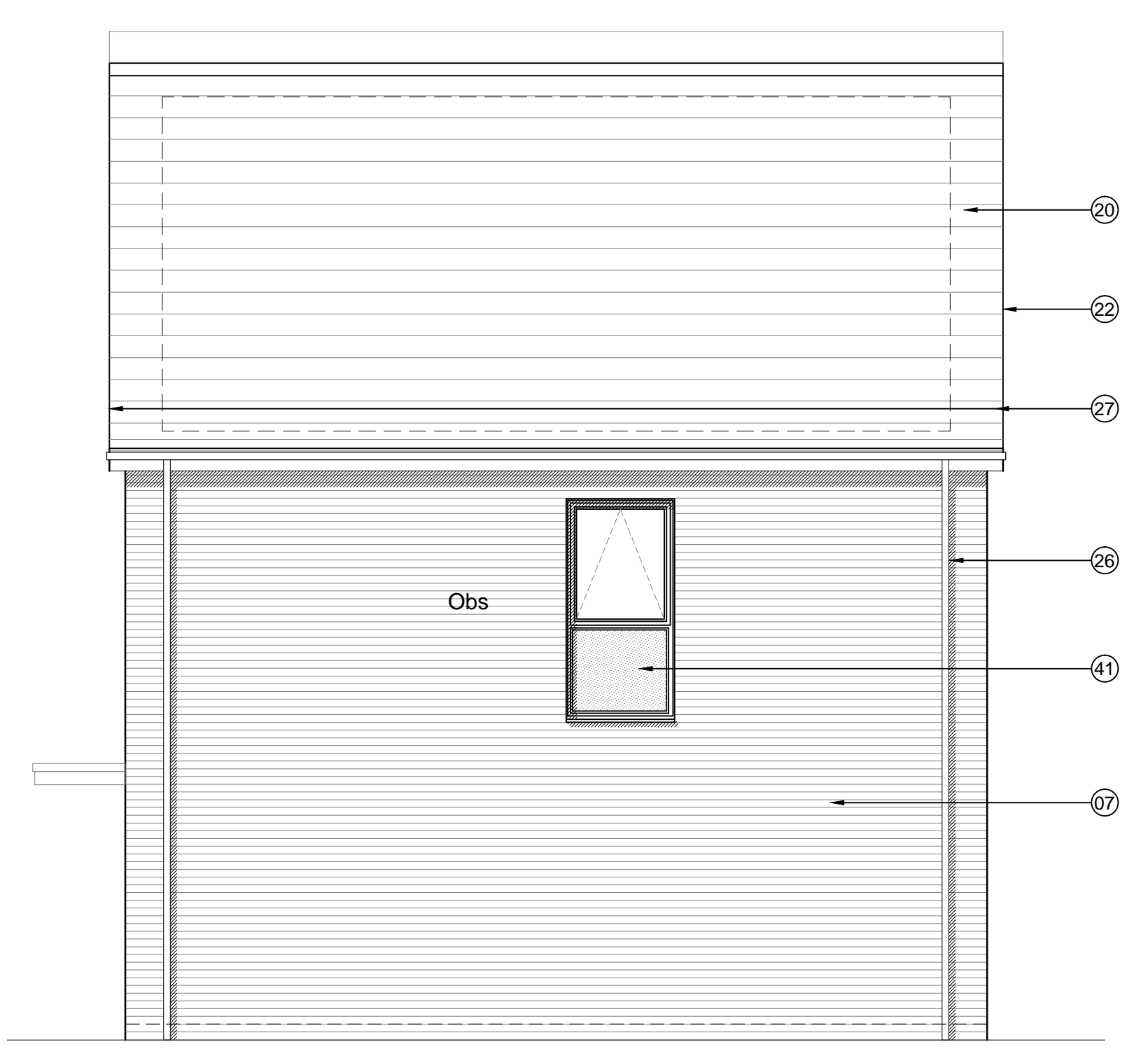
PLOT 251 SIDE 2 ELEVATION