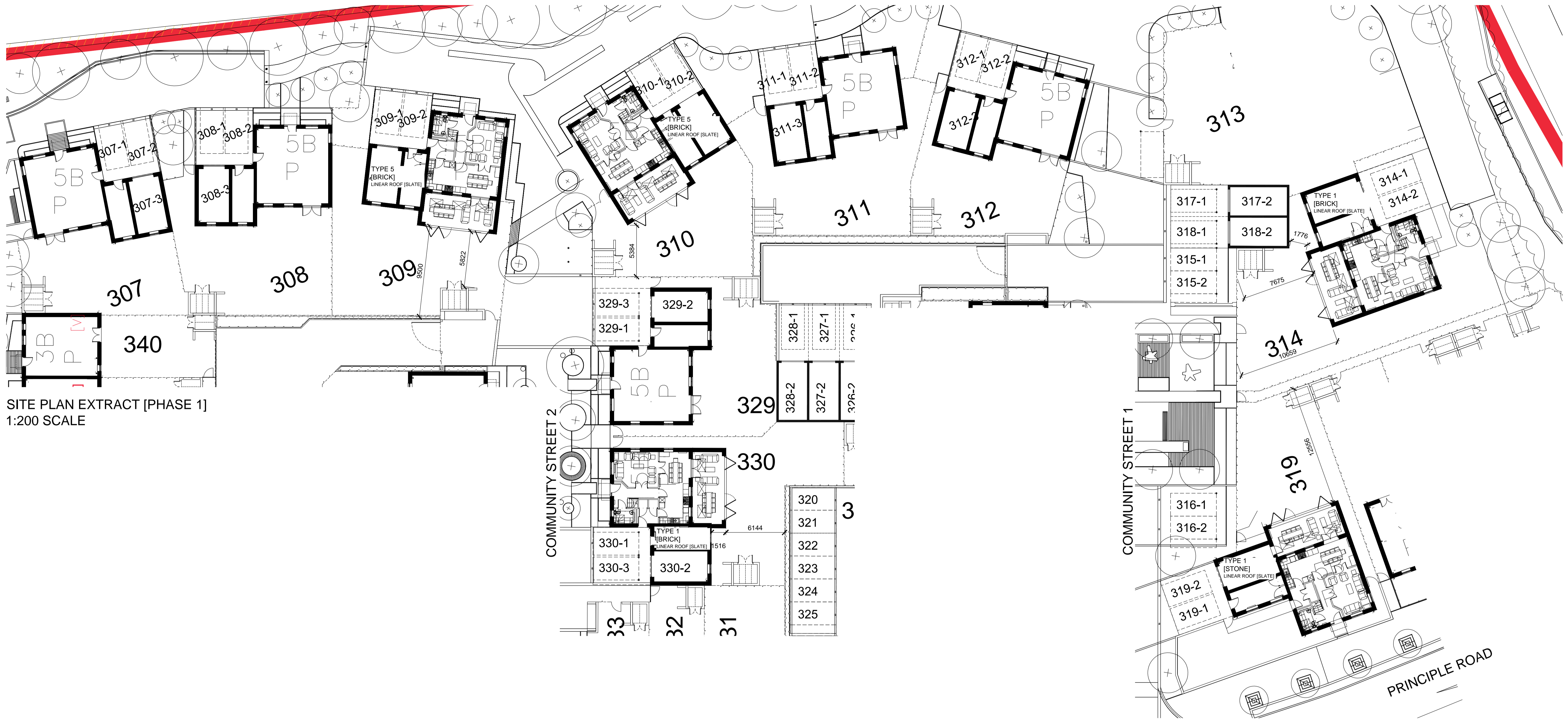
SITE PLAN EXTRACT [PHASE 1] 1:200 SCALE

NOTE: FOR PROPOSED ELEVATIONS [1:100 SCALE] PLEASE REFER TO DRAWING AA2699C/1.1/111