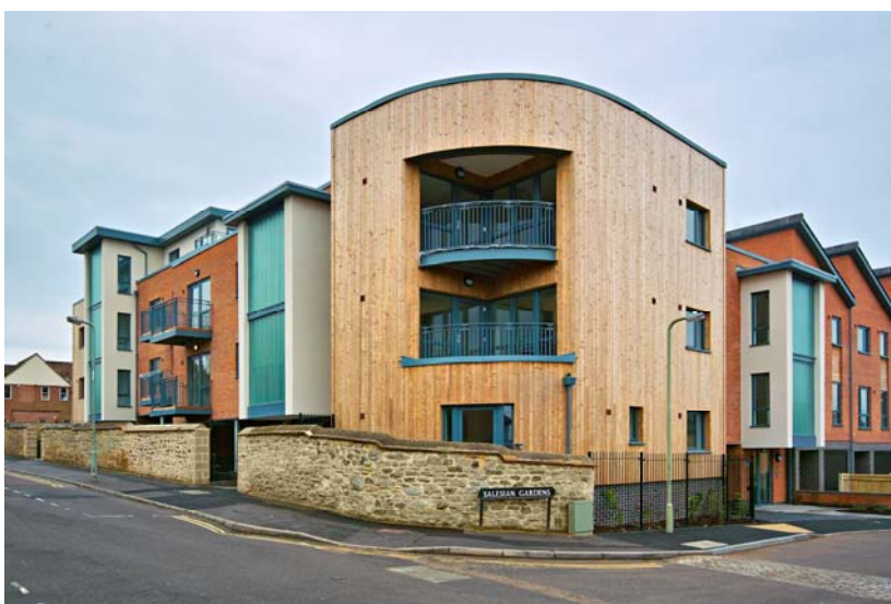
Salesian Gardens, Oxford