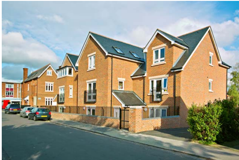
Tree Court, Iffley Road, Oxford